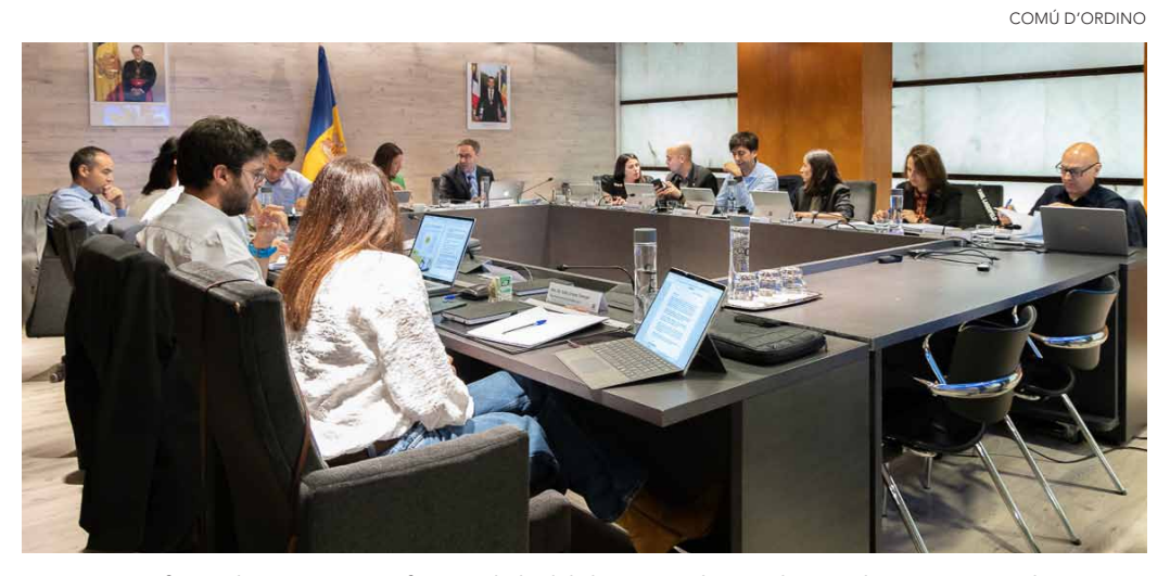
\label{eq:Amoment from the meeting of consuls held this Tuesday in the Ordino Municipality. \\

This is a project proposed by the capital's entity that aims to support generational change in businesses that will close in the short term, due to early retirement, and so that there are no empty premises left within the commercial fabric. Therefore, work will begin soon, in principle this month, between the Chamber of Commerce and Andorra Business, with the support of technicians from each municipal corporation, to launch a portal similar to that of Reempresa, a marketplace for buying and selling small and mediumsized businesses in Catalonia.