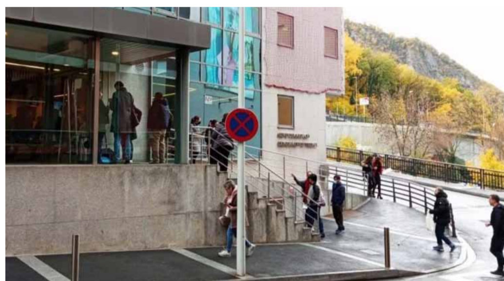
The queues caused at the Department of Labor of the Government Immigration Service.

In general, the number of temporary workers has increased by 5.7% compared to the same period last year. The dynamics of hiring on April 18th is, compared to the previous year, a positive 6.7% of the consumption of quotas for non-EU workers and a positive 1.6% of the consumption of quotas for EU workers. Spe-