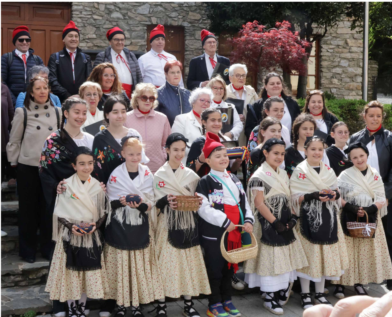
The singers of the Rocafort choir present at the caramelles 2025.

More than thirty children and young people participate in the singing held in Sant Julià de Lòria