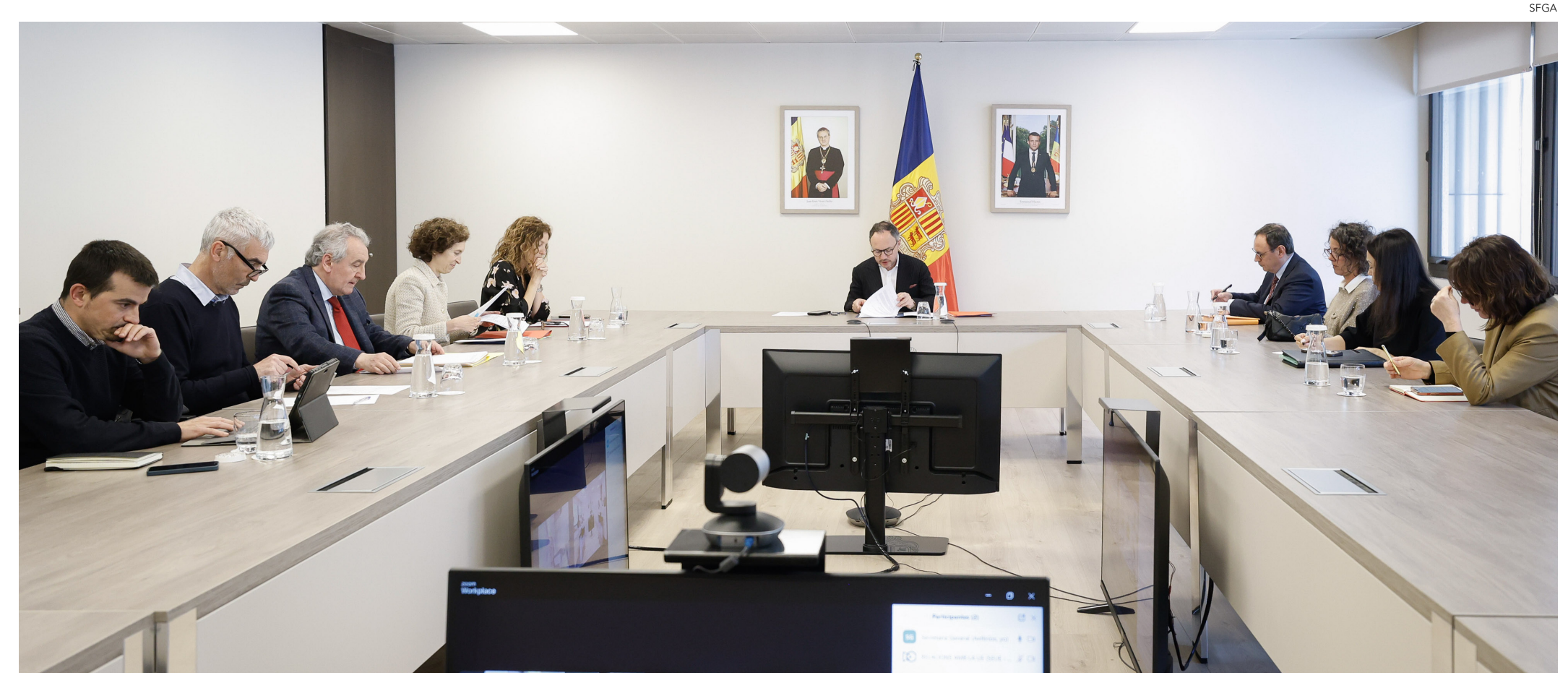
The Government activates a working group to explore access to liquidity services and defends that any agreement must preserve the general interest.

Access to a lender of last resort is still subject to pending guarantees