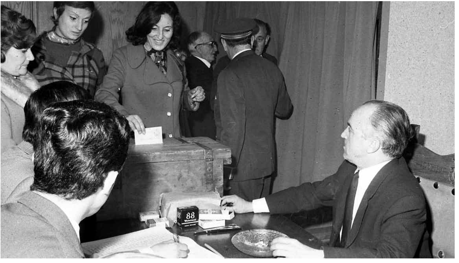
The first women who exercised the right to vote in December 1971.

The decree, the result of a process that lasted for almost two years, established in its only article that: "Women in possession of full Andorran citizenship will have the right to vote. This right will be exercised in the same cases and under the same conditions as those provided for men".