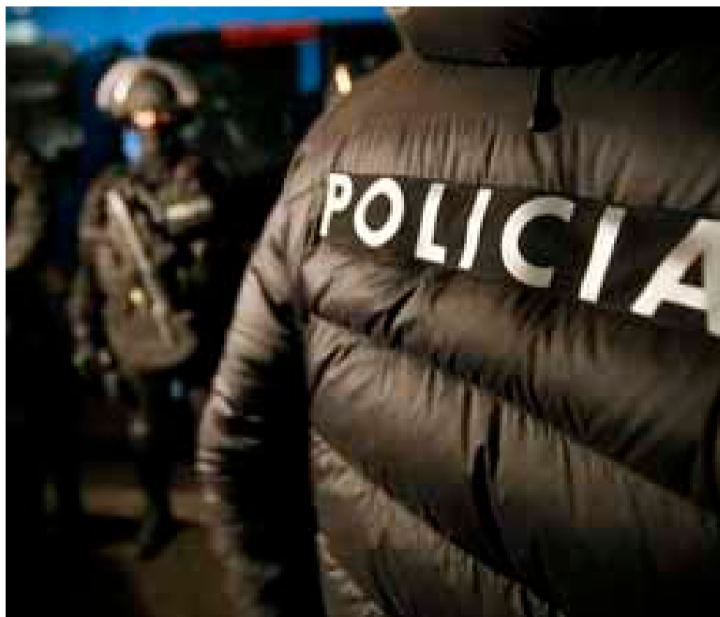
75.5% of them claim to feel very safe, compared to 65.2% of women, while only 2.2% declare to feel unsafe.

By age group, young people aged 15 to 29 are the ones who show a higher perception of safety (76.8%), followed by adults aged 30 to 44 (75.7%) and those aged 45 to 64 (71.9%). The percentage decreases significantly among those over 65, with only 52.6% declaring themselves very safe.