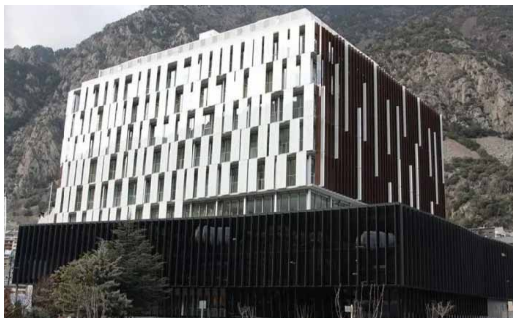
The specialized witnesses have questioned the coherence between the victim's testimony and the physical evidence.

The trial against the two accused men has reached its final phase this morning. The Public Prosecutor's Office has reiterated its request, requesting an eight-year prison sentence and expulsion from the country for 20 years for the older defendant – the uncle of the other defendant. In the case of the nephew, a sentence of eight years and three months