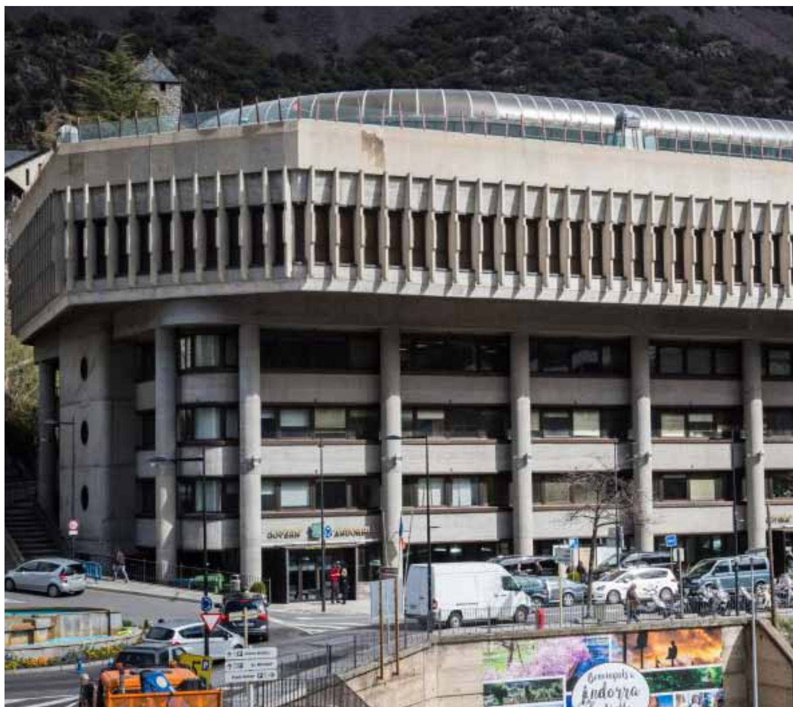
The Government administrative building in an archive image.

To achieve this, the group has drawn on all the technical, economic and legal aspects so that the modification they have presented can be implemented directly. In any case, however, this decision depends on the Ministry of Economy. It should be remembered that the Andorra Esports Cluster is a public-private entity – more private than public – in which the public part depends on the aforementioned portfolio. In this sense, last Tuesday both