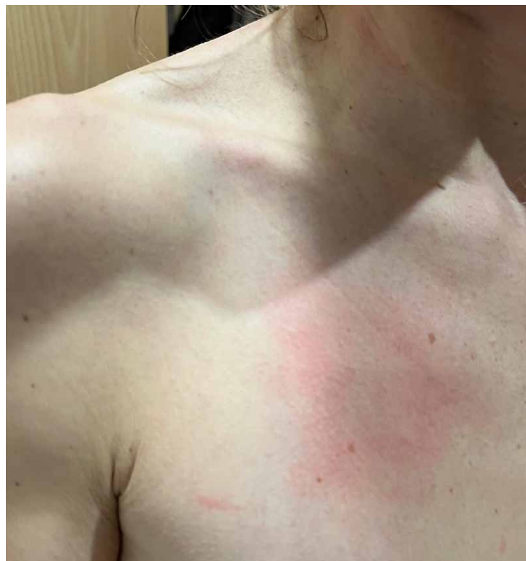
The victim shows the various bruises on both her body and face due to the punch she received.