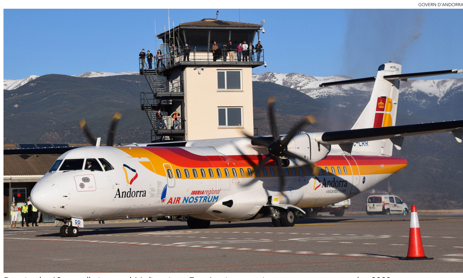
Despite the 10 cancellations and 16 diversions, Forné points to an improvement compared to 2023.

Despite these incidents, the data reflect an improvement compared to 2023, when 5% of operations were canceled, 10% were diverted and a further 5% suffered other disruptions. Forné stressed that "2024 has been an atypical year in meteorological terms, according to the AEMET and the airport manager". In addition, the