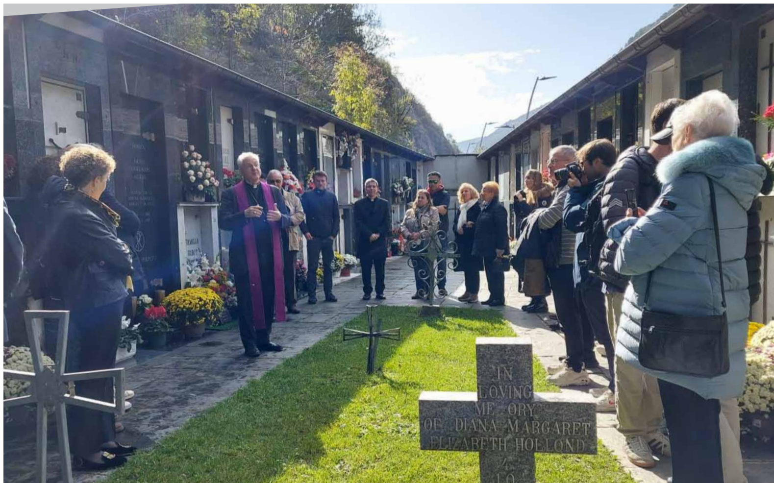
The co-prince Joan-Enric Vives in the cemetery, last Friday.