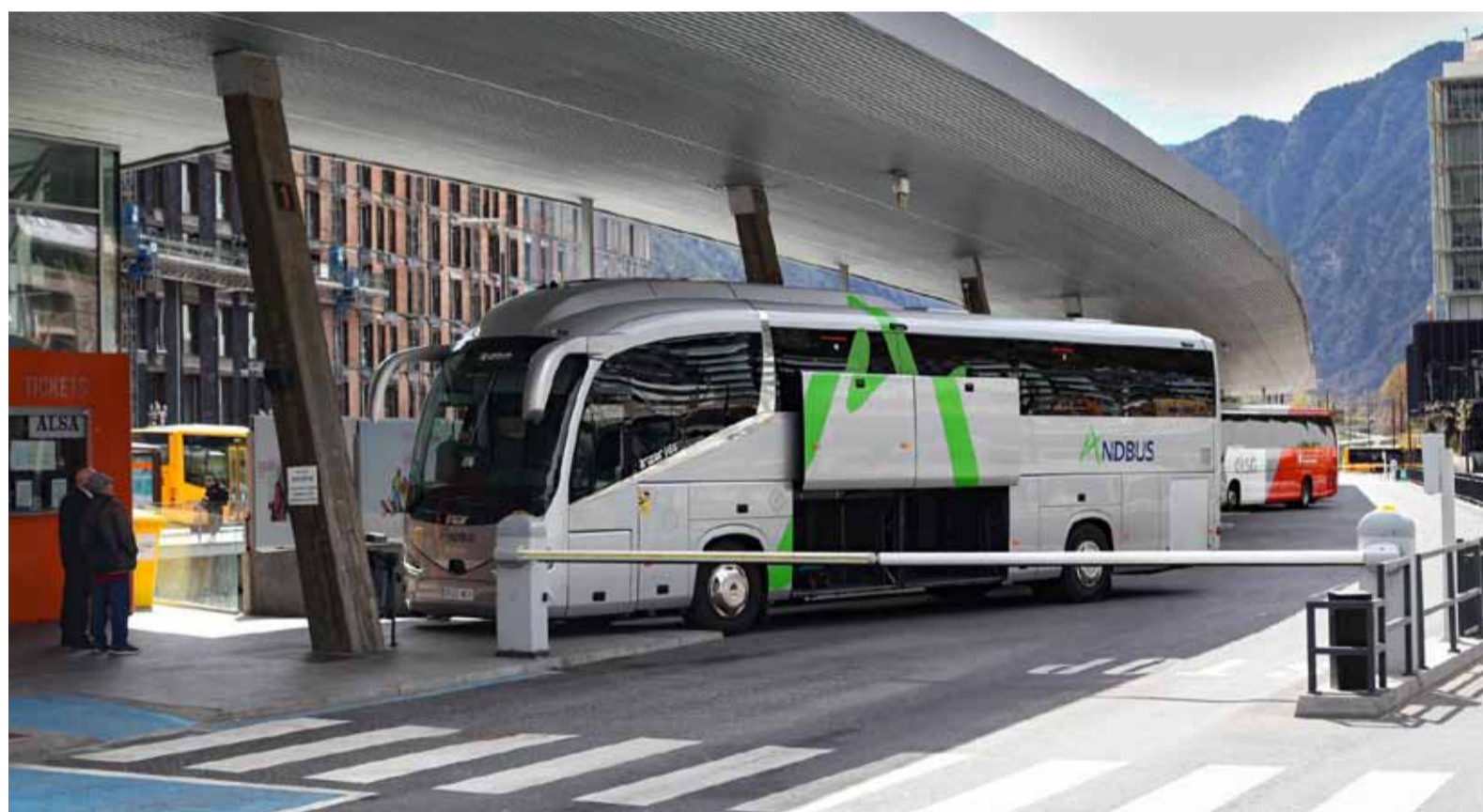
A company bus at the National Bus Station.

The Andbus company updates the regulations to allow dogs, cats and ferrets