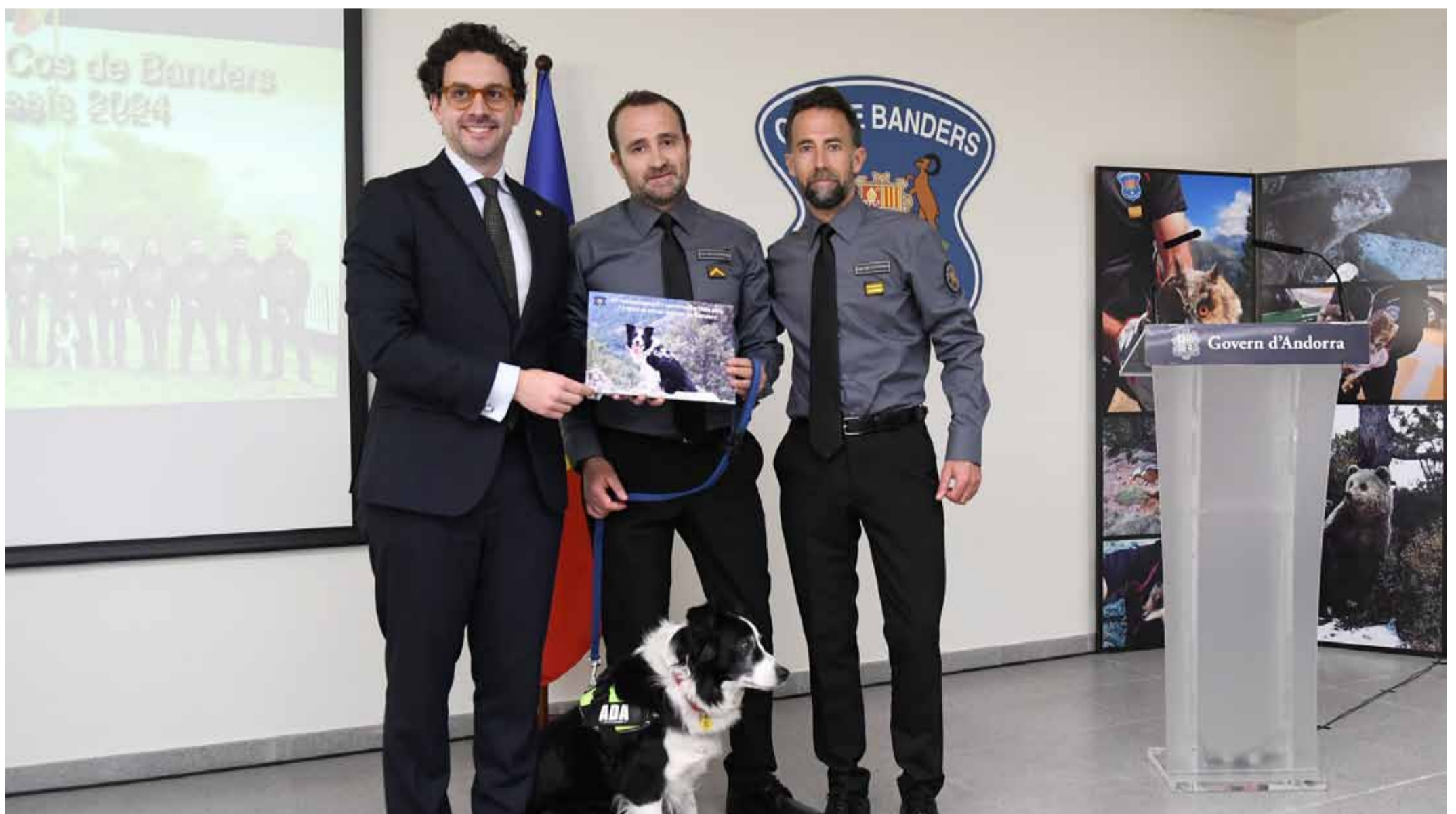
The Banders Corps agents with the Minister of the Environment, Guillem Casal, during the celebration of Saint Francis of Assisi Day.

Another priority is to increase the presence of women, a pending issue for 20 years