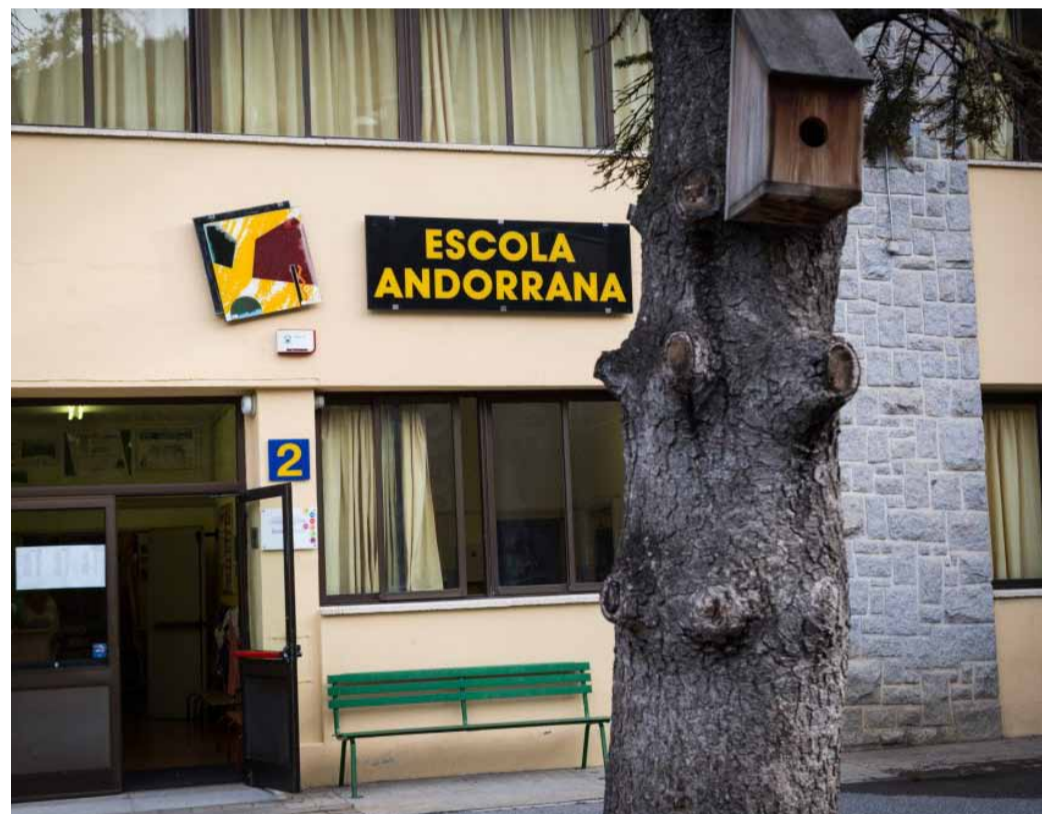
The Andorran School of Sant Julià de Lòria.