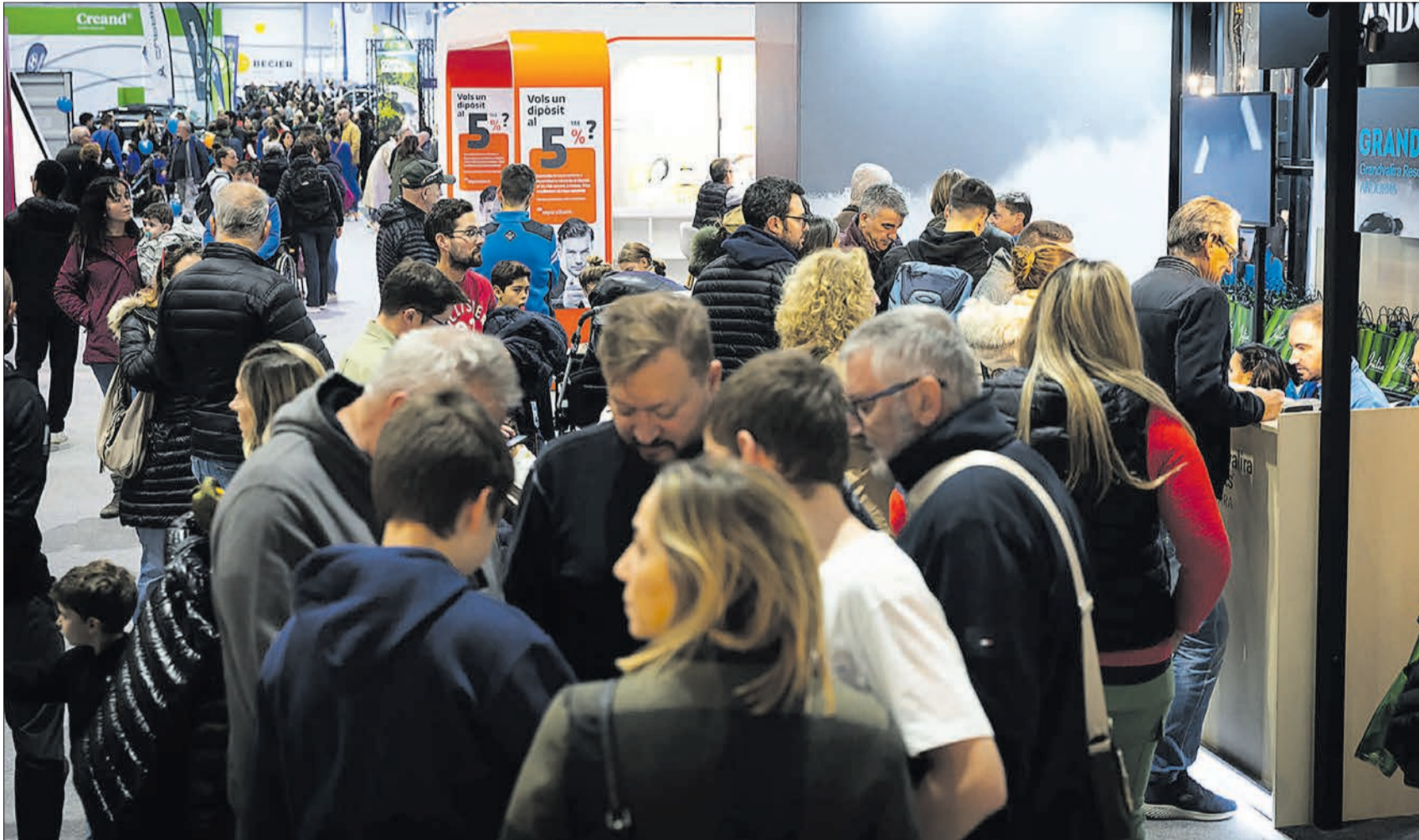
►► Residents and citizens at the 44th edition of the Andorra la Vella Fair.