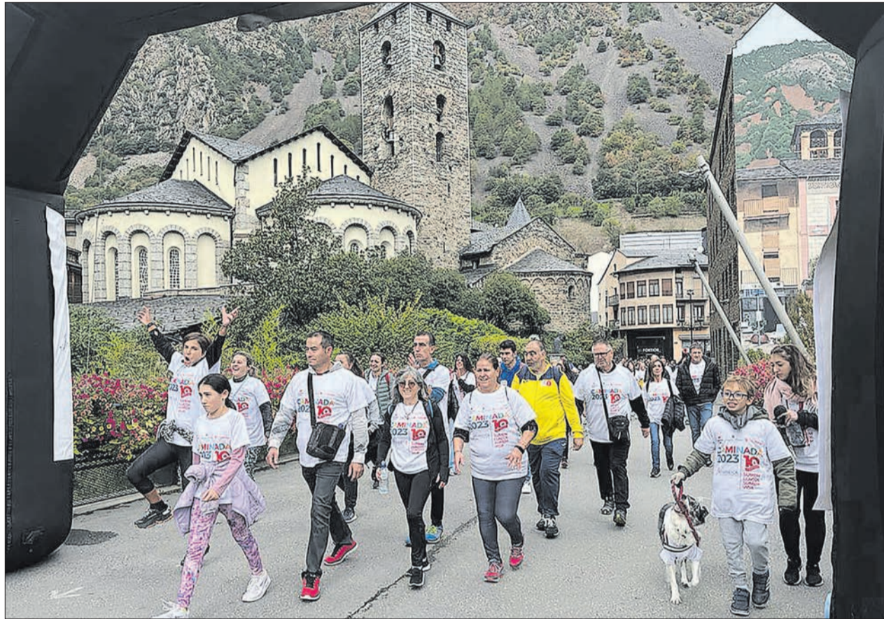
► The participants reaching the end of the Walk Against Cancer 2023.