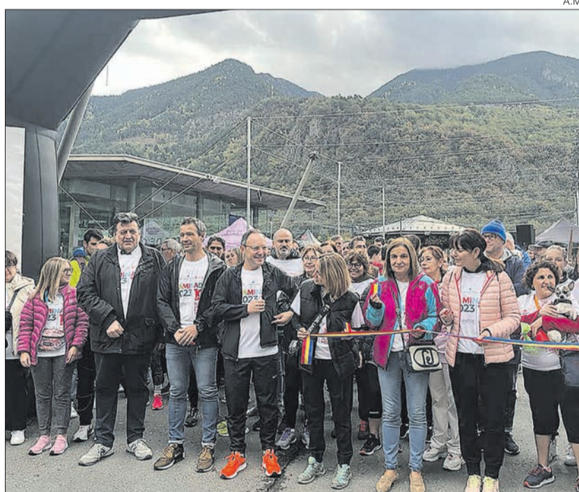
► Start of the Walk Against Cancer 2023.