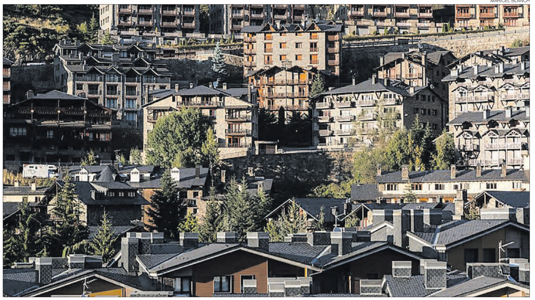
▶▶ Various tourist apartments in the Tarter area.

From the AEAT they assure that the 'overbooking' situation of 2021 will not be repeated this year