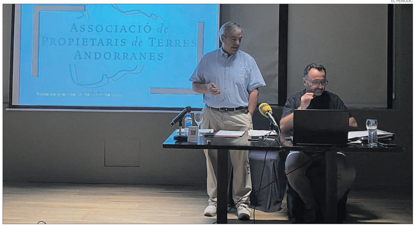
▶▶ A moment from the APTA press conference, in Andorra la Vella.

They also require collaboration with all administrations when approving ordinances