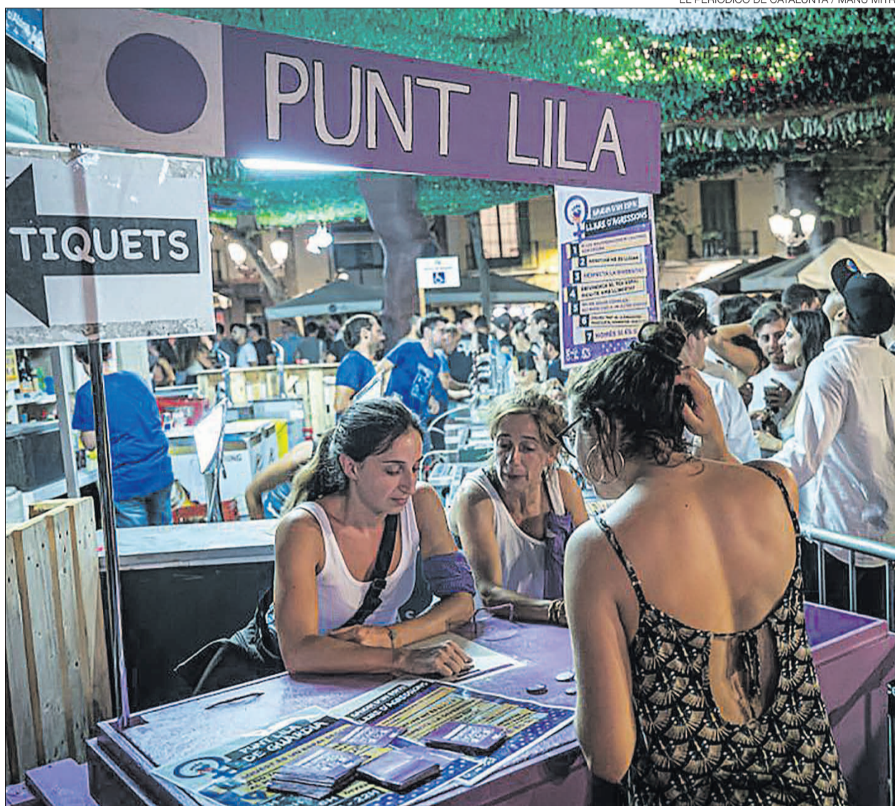
►► A Purple Dot against sexist attacks at the Gràcia festivities in Barcelona, this summer.

But, beyond a vexatious treatment, this kind of conduct is usually the first stage of a relationship where physical aggression ends