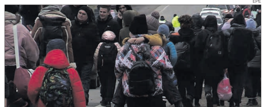
►► Ukrainian refugees.