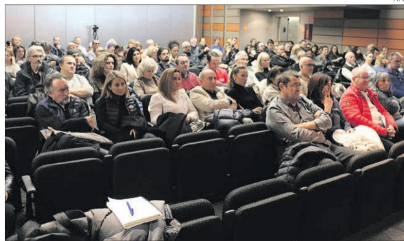
► The Cortinada room was practically full.

«There are many ambiguous elements and that is why, although the works have started, there is a lot to