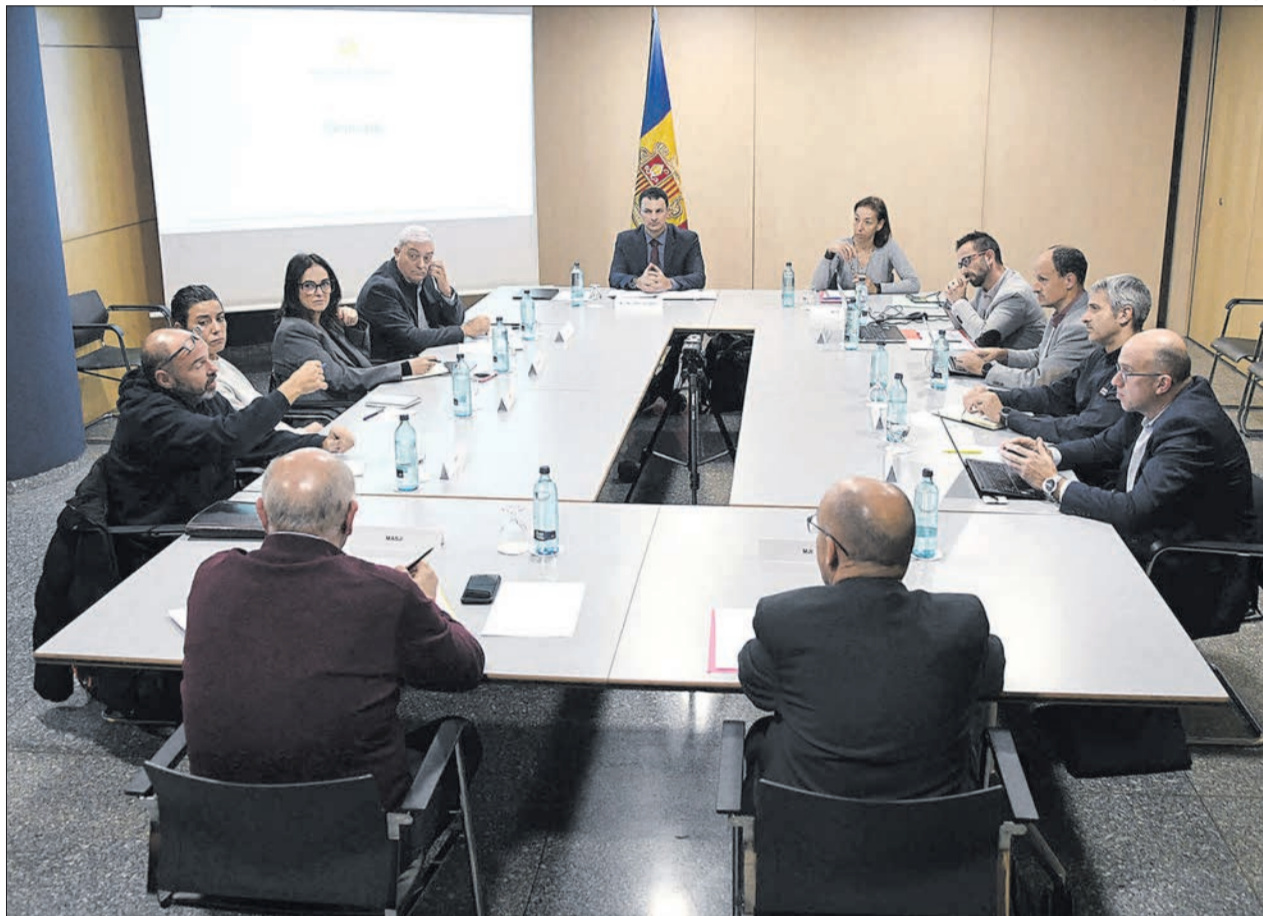
► A moment of the economic and social council held this Tuesday.

Asked about the impact that this increase in the CPI could have on rents, the Spokesperson recalled that the Government continues to defend that wages and rents must be linked in the increase and pointed out that it will now be necessary to see how it is finally fixed in the text that is in the parliamentary pro-