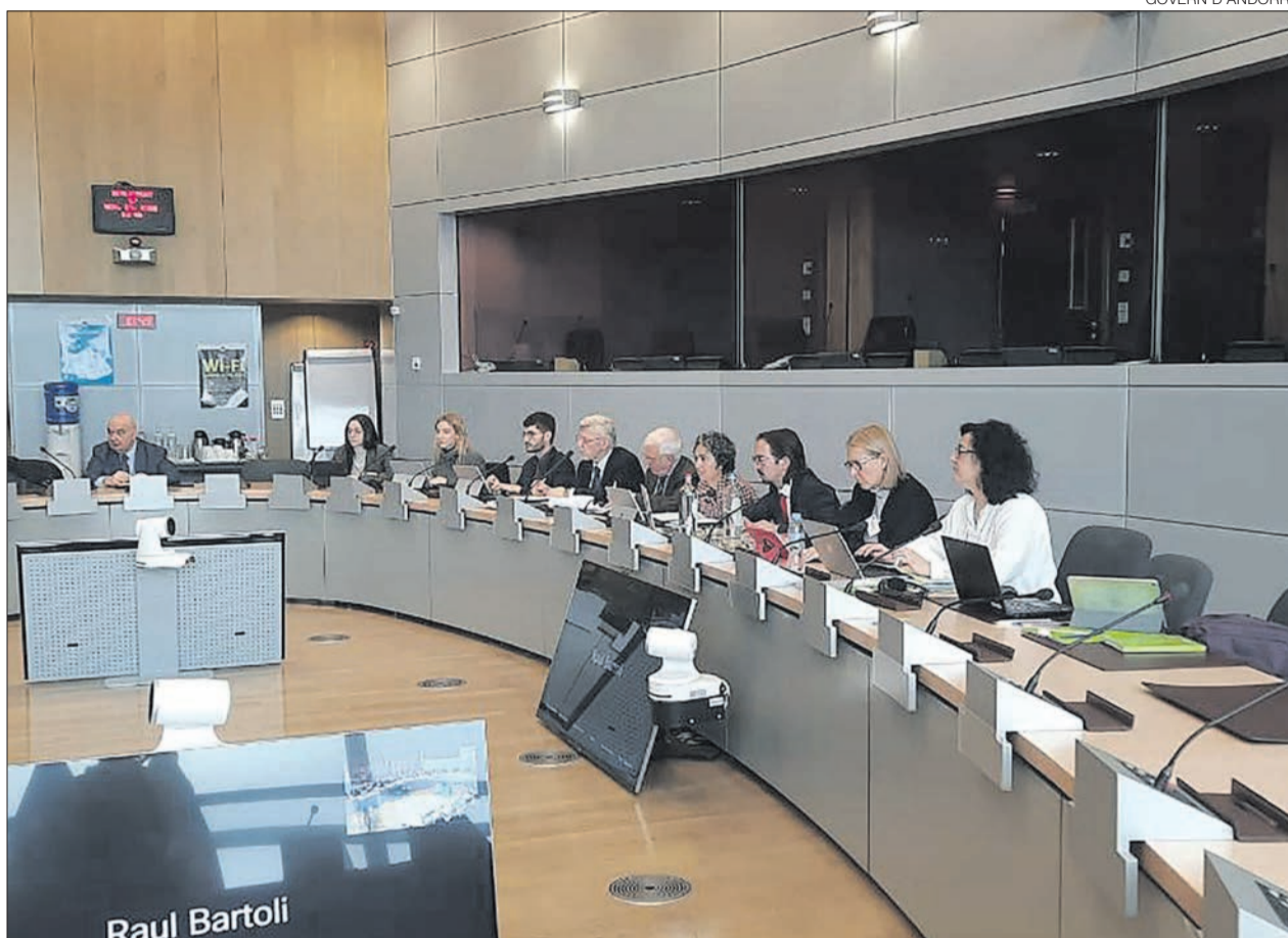
►► A moment from the meeting between Andorra and the EU held this Wednesday.

In relation to the free movement of people, Andorra and the European Union continue to analyze in detail the mechanisms for regulating migratory flows and the procedures applied by Andorra. The nego-