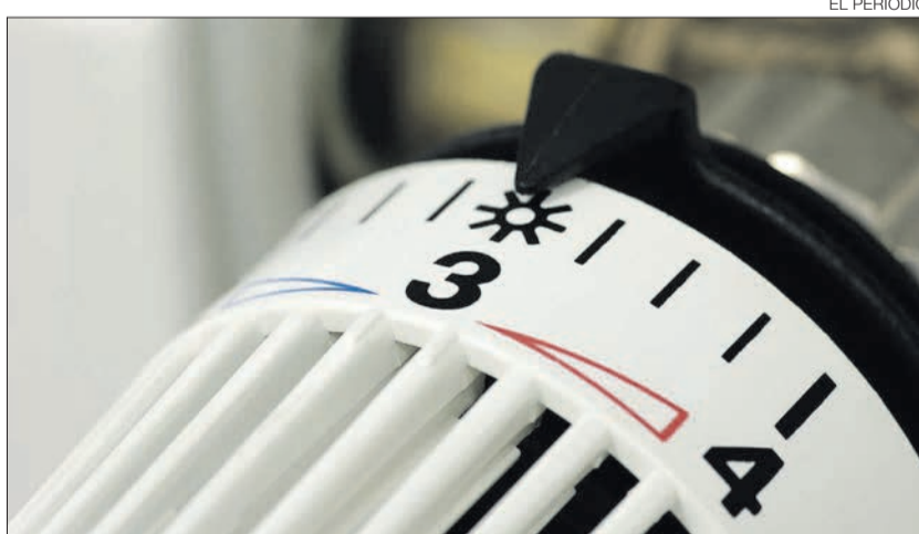
► The meter of a heating.

son. In this way, in order to access the check, people will need to have legal and effective residence in the country and prove a minimum of three years of residence. Applicants' income must be 1.3 times the LECS, the same formula that is used in the items intended for housing aid. In addition, Jover pointed out that those family units that have certain assets will not be able to access the benefit despite the fact that at a given time they have the lowest incomes. People who have heating included in their rent will also not be able to benefit from the check, as long as the variation has not un-