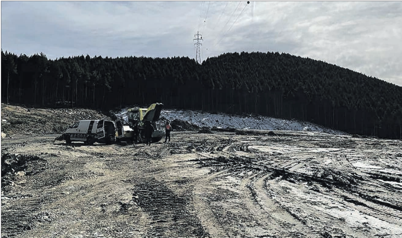
►► Archive image of the Beixalís landfill.