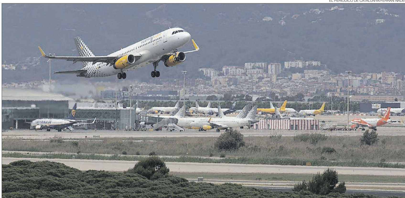
►► A plane from El Prat Airport takes off.

EL PERIÒDIC ESCALDES-ENGORDANY @PeriodicAND