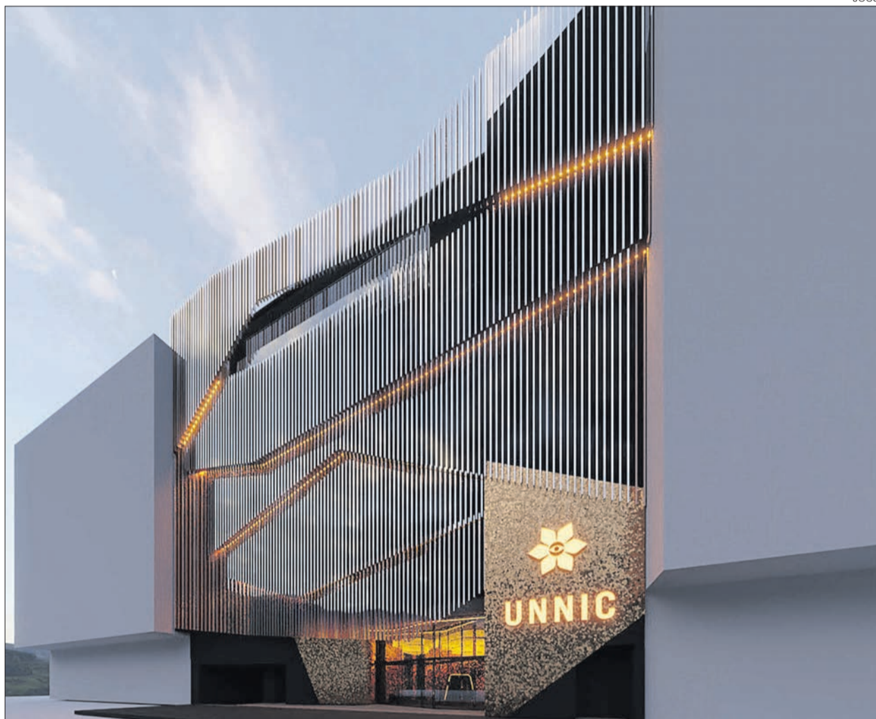
► Simulation of the casino façade, once finished, in Prat de la Creu street in the capital.

Jover explained that the CRAJ had taken into account the arguments and documentary evidence put forward by the concessionaire