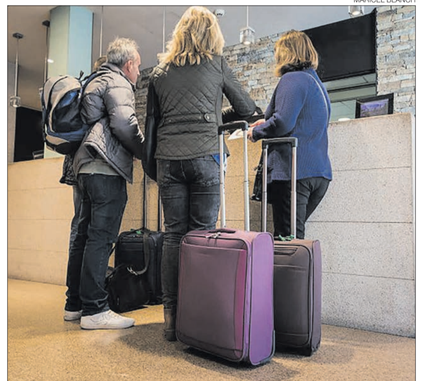
► Tourists in a hotel of the country