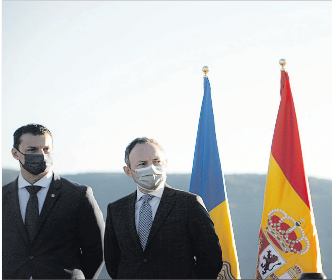
► Espot and Gallardo during the inauguration of Andorra-La Seu d'Urgell Airport.