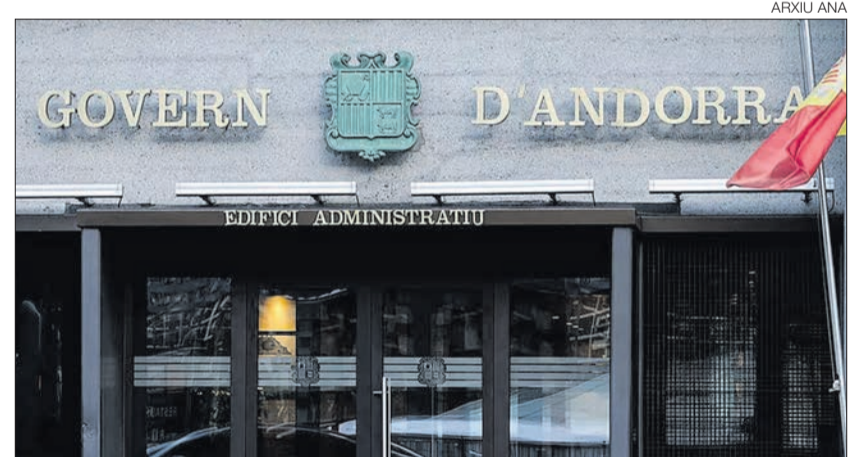
▶▶ The administrative building of the Government.

The budget result was a deficit of 174.13 million euros, with a variation of 12.6%. ≡