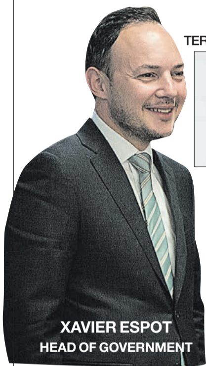
XAVIER ESPOT HEAD OF GOVERNMENT