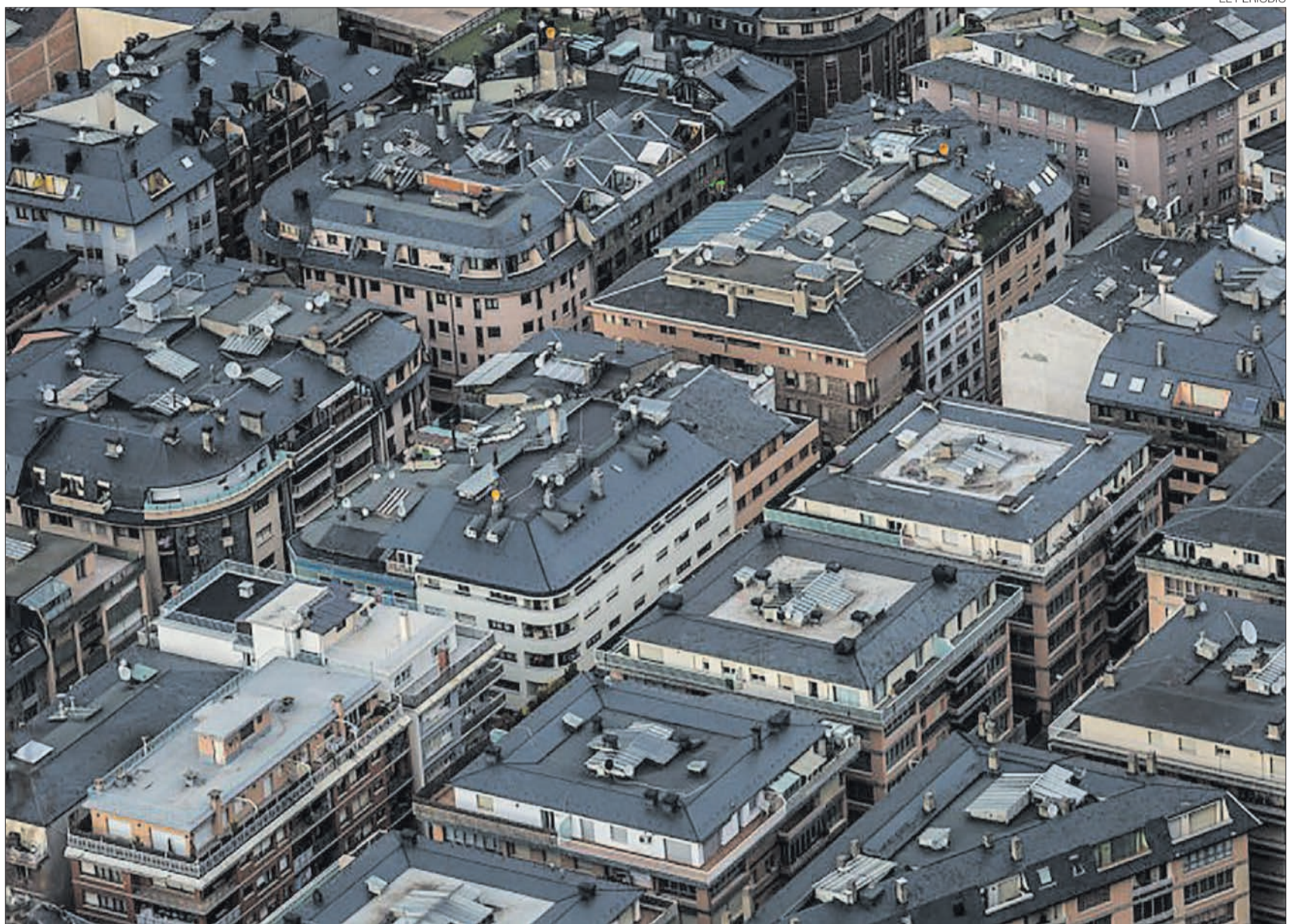
► Aerial view of buildings in the Central Valley.

In second place in the ranking of queries in the office during 2021 is, with 16.24%, the demand on the requirements and documentation to be submitted of the various aids by the administration in the field of housing, a type of consultation that in the previous year, in 2020, was prominent in first place, with 31.8%. As for the consul-