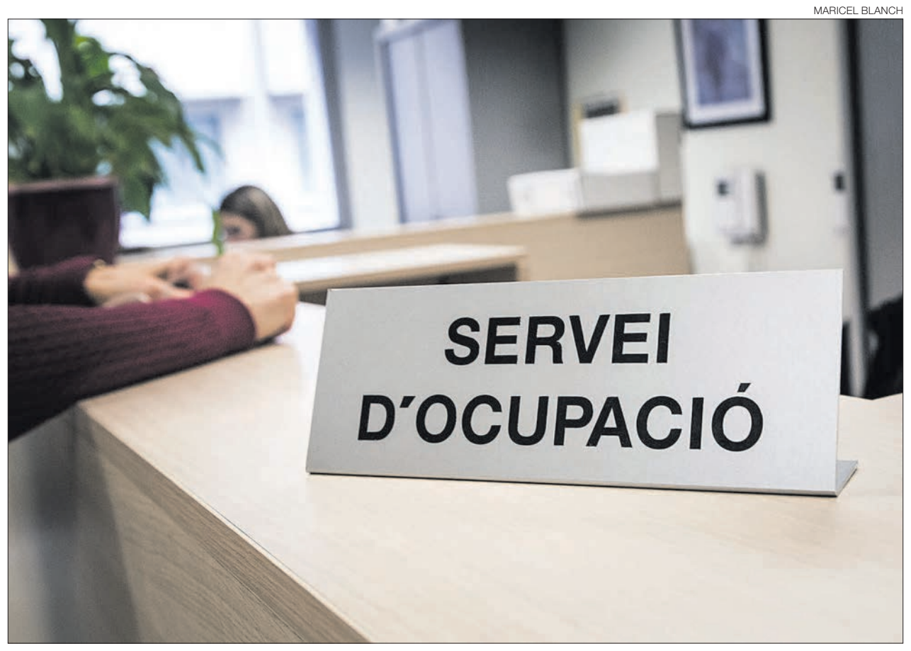
▶▶ A person is attended by the Andorran Employment Service (SOA).

However, Jover pointed out that the main task is to «differentiate those enrolled between these storms and those who have an extended stay because they have difficulty re-occupying», which with the decrease in registered, is provided. At this point, the different training options proposed by the administration also have an im-