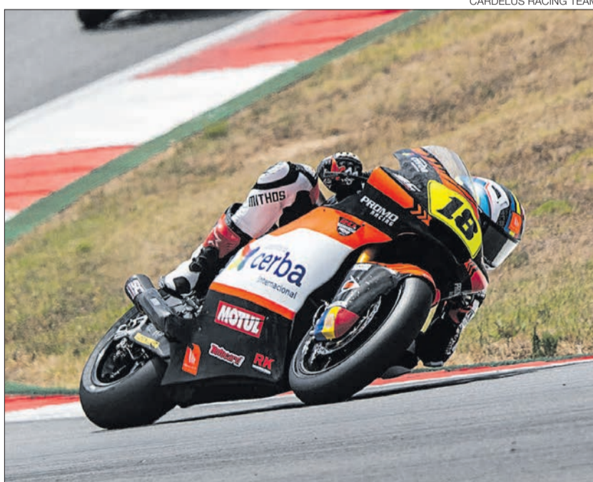
CARDELÚS RACING TEAM

-Completely. I'm sure that if it hadn't been for the injuries, in Estoril I would have been fighting for