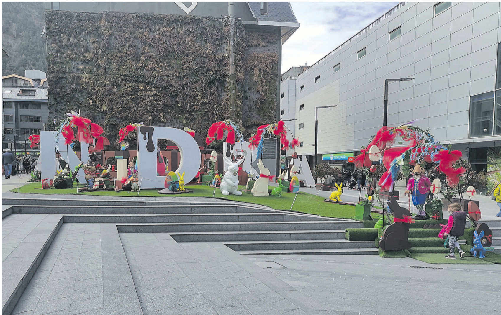
►► The Letters of Andorra decorated for Easter.

On Thursday, El Periòdic went to the streets to learn about the experiences of citizens at this party || Children, adults and the elderly celebrate Easter together and as a family in Andorra