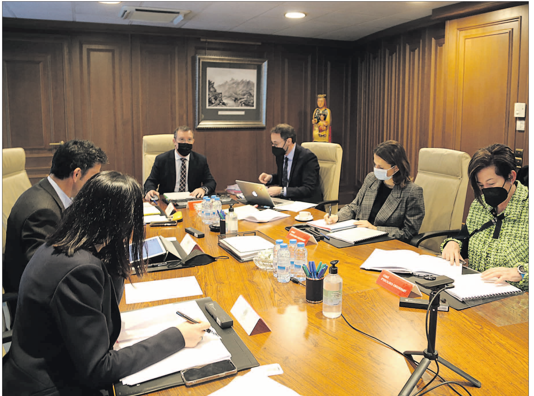
►A moment from the meeting of consuls held the day before yesterday in Sant Julià de Lòria.