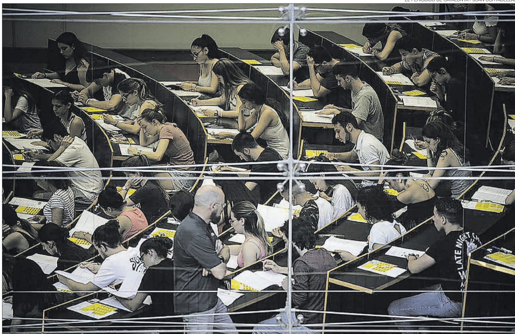
► Archive image of some Catalan students taking the university entrance exams.

Regarding the working environment in Andorra, the majority of young people surveyed said that they saw gender equality in aspects such as wages (73.9%), job opportunities (65.2%), stability in the workplace (69.6%), access to education (82.6%), and access to positions of responsibility in companies (56.5%). For their part, the girls agreed to find equality in the majority of job stability (35.4%, although very close to the 29.4% who find it worse) and for access in education (82.4%), but they recognized worse wage conditions (61.8%), job opportunities (50%) and access to positions of responsibility in companies (70.6%). In the same vein, although all respondents pointed out that 82.5% believed that there were no women's and men's careers, they did list professions such as nursing, cleaning staff, teachers and secretary, or receptionists such as those who would have more presence of women, and on the other side of the coin, targeted more men developing the trades of security forces, construction, mechanic or doctor.