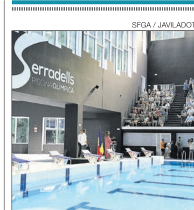
SFGA / JAVILADOT

Regarding the felling of trees that the municipality of the capital has carried out to enable the route of the electricity company's heat network, the municipal opposition points out that they did everything possible to avoid extracting «a component natural essential for such a busy place in the center of the capital». However, after holding an environmental commission with different experts, they assured that it was necessary to cut down the trees in the Prat de la Creu sidewalk area. Despite the complaints expressed by some residents of the area, Gon-