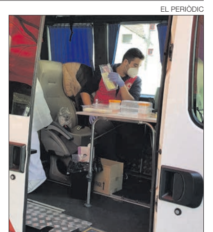
►► Archive image of a mobile StopLab.

Tourists and visitors can access these tests on the same devices provided for residents of the country, as is the case of the Plaça de Braus and the StopLabs of Escaldes-Engordany and Pas de la Casa. At the same time, they also have resources available such as pharmacies and private laboratories, although in these the prices are set by each company. ≡