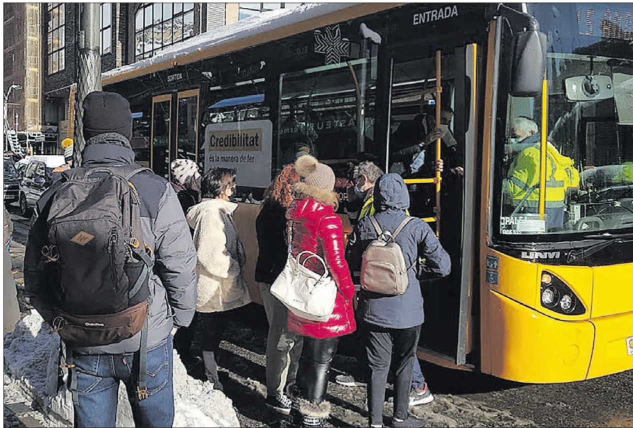
►► Users boarding an L5 bus in La Massana.

As for the current state of national public transport, the Coopalsa manager assessed that «due to the pandemic, we are a little below what we should be» in relation to the number of users who make it at the same time, he considered that having a limit on the capacity of the buses in force «harms the quality of the service a bit», especially because they are not happy. «We are one of