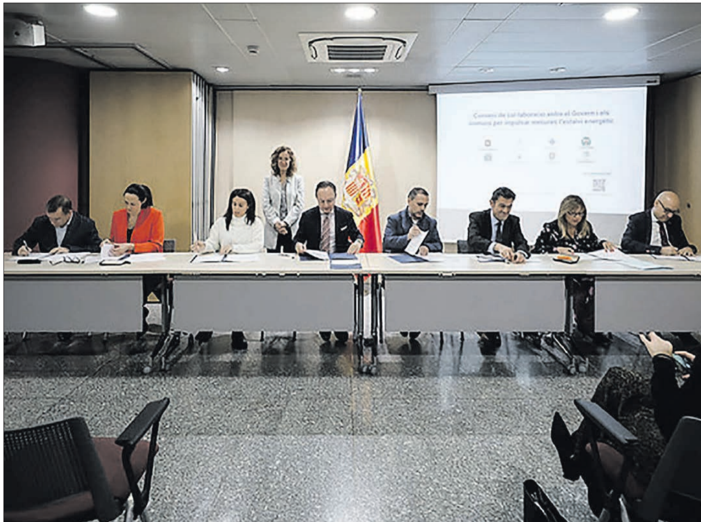
►► A moment of signing the agreement.

After the agreement signed 15 days ago with the business sector, last Thursday was the turn of the municipalities, «a key piece to achieve the objectives that have been set», according to the head of government, Xavier Espot. The scope of application of the agreement includes the communal administration, the bodies that are under them, the autonomous bodies, the entities under public law also dependent on the municipalities and the public companies in which the communal administration has a capi-