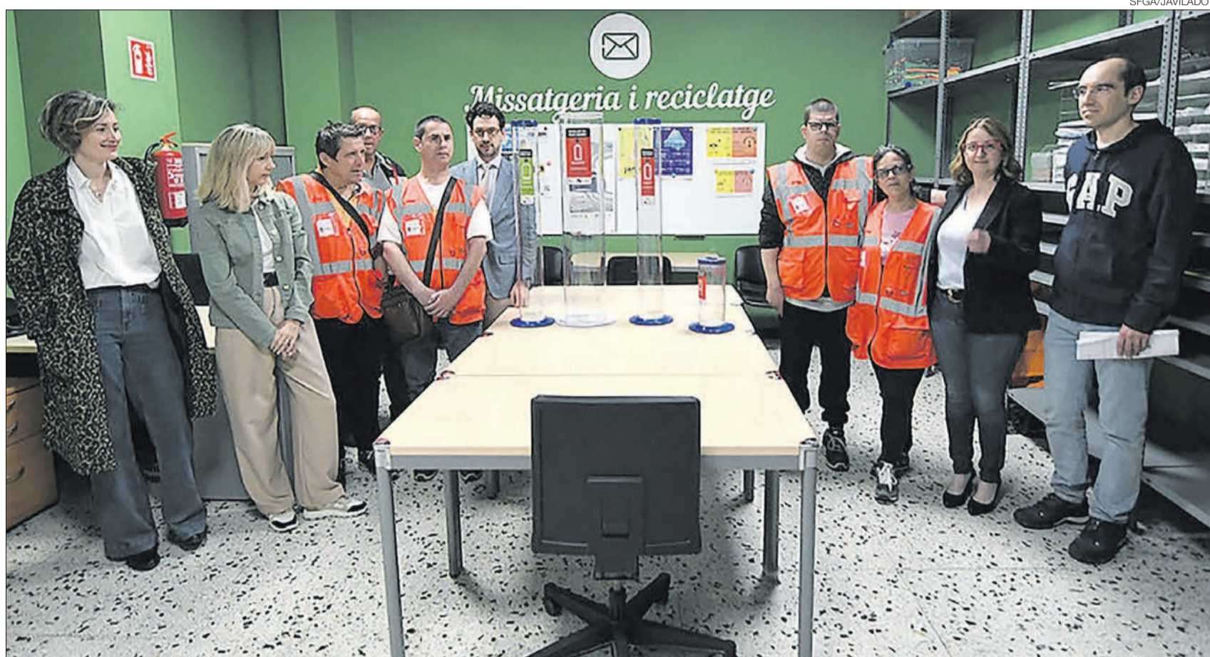
►► Image of the delivery of the battery containers.

Throughout the week, the Government has organized activities for World Environment Day