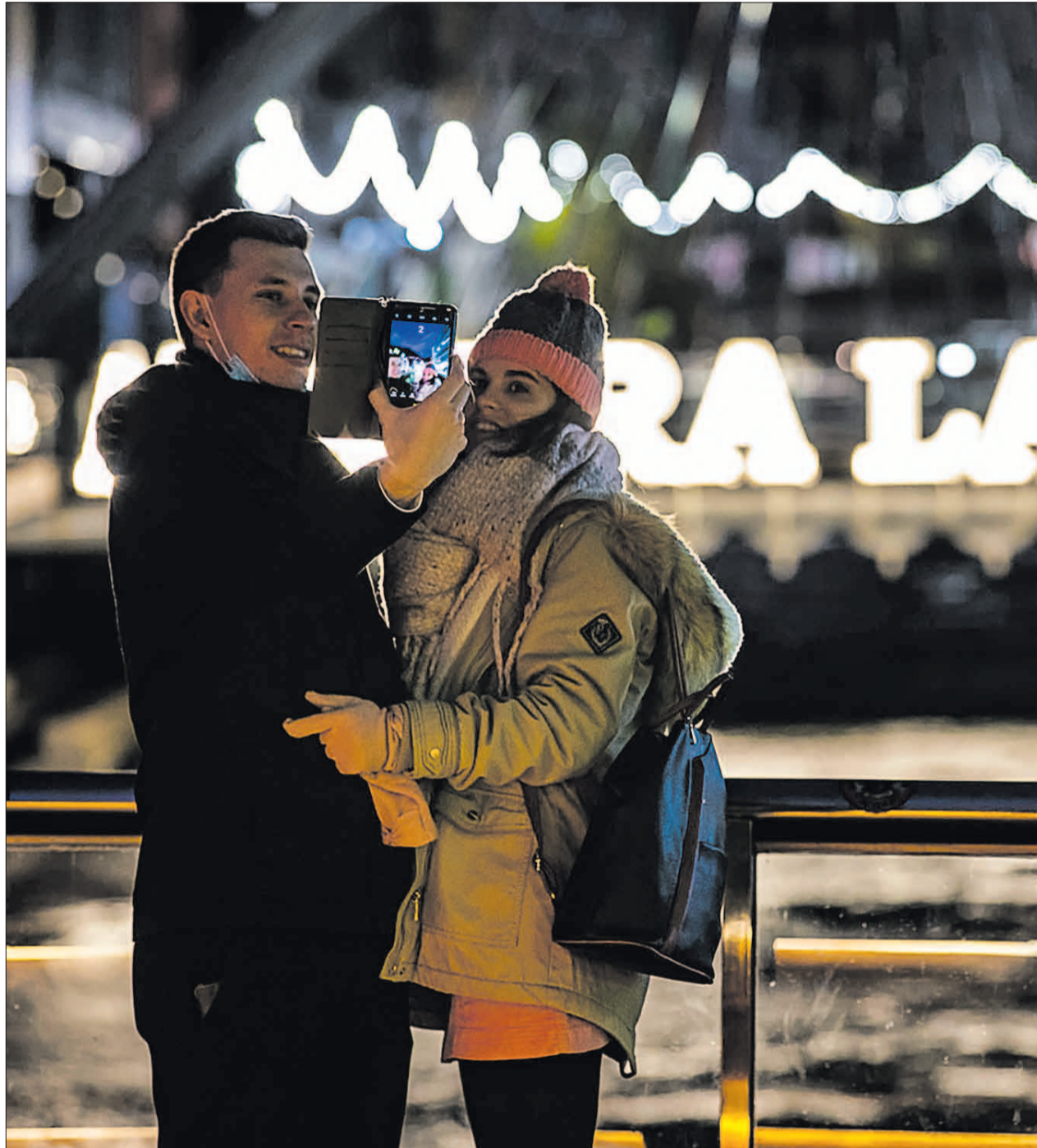
► Some visitors take a picture in the capital.

At the same time, the UHA made public before yesterday the balance of occupancy of the associated hotels during the New Year's weekend, where it was revealed that the average between December 27 and December January 1 had been 89.31%. «Looking at the almost 90% occupancy rate for New Year's Eve, the assessment is positive, but we think it