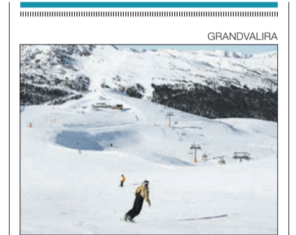
► The Grau Roig sector.

In any case, this first week of the year coincides with the celebration of the Day of the Three Kings, which is celebrated in the Principa-