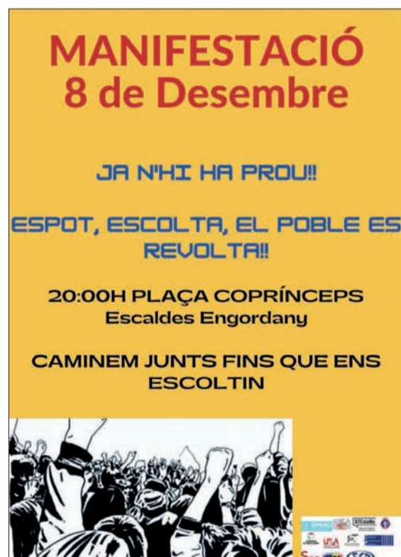
►► One of the posters of the demonstration that the organization is distributing.

demonstration is the Union of Public Education (SEP), which precisely last Friday made a statement in support of the march in which it explained the reasons why, according to them, the negotiation has failed in improvement of the Economic and Social Council (CES). First