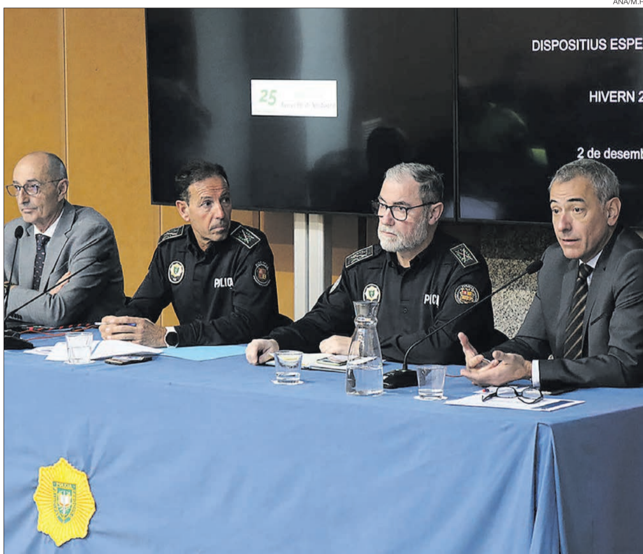
► Image of those responsible for mobility during the Traffic Technical Table, last Friday.