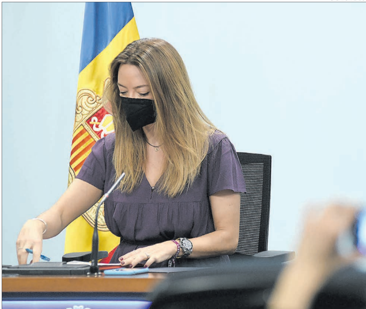
SFGA / JAVILADOT

The new protocol provides that once a person is confirmed posi-