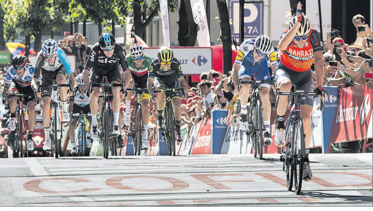
▶▶ The end of the stage that took place in Andorra la Vella during La Vuelta 2017.