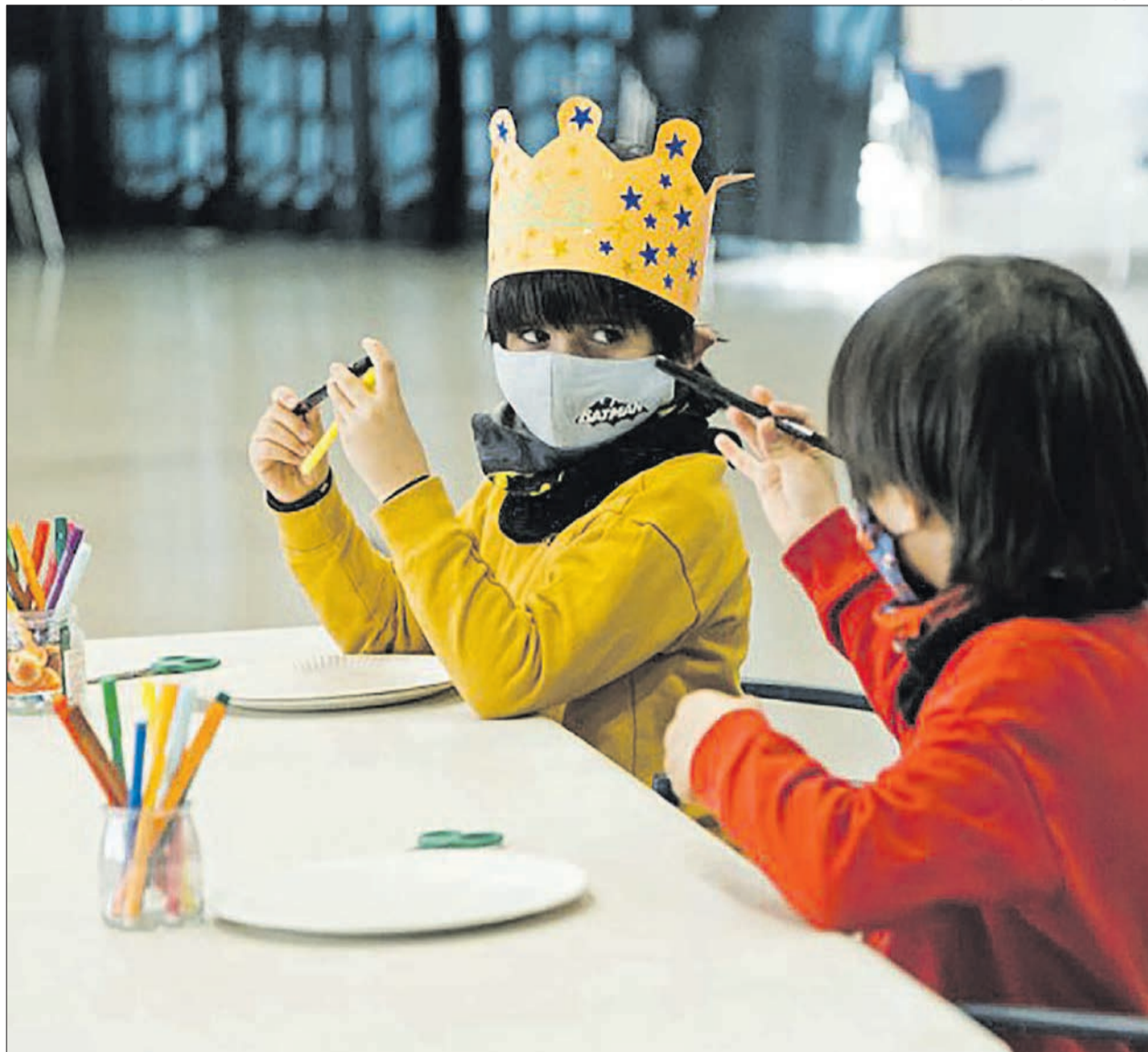
► Two children wearing masks in an activity.

Regarding the updating of health data, in the last 24 hours the Ministry of Health has detected 84 new positive cases, with 71 new discharges. The number of active cases has increased by 13 people, leaving a total number of 578. As for hospital pressure, there are two patients less admitted to the Hospital Nostra Senyora de Meritxell: 13 in total, nine per floor (-2) and four in the Intensive Care Unit (ICU), three of which require mechanical ventilation. In terms of impact on education, there are 12 classrooms (-2) under passive supervision and none actively. Finally, since the start of the vaccination plan, 155,836 vaccines have been administered: 57,978 first doses, 57,233 second and 40,625 third.