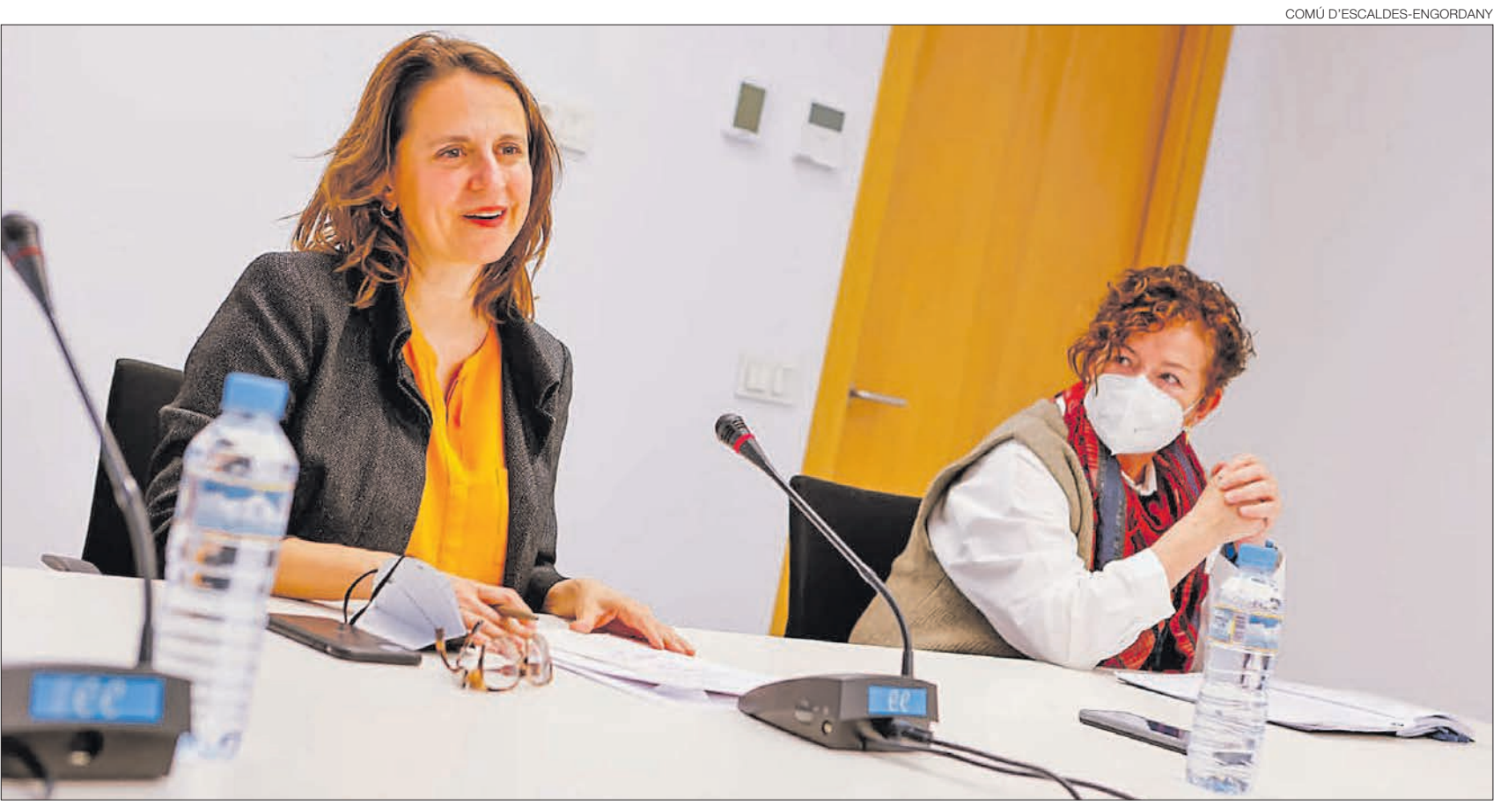
▶▶ The Consul General of Escaldes-Engordany, Rosa Gili, and the Minister of Social Affairs, Magda Mata.

The municipality announces a competition of ideas with a prize of 14,000 euros for the winners