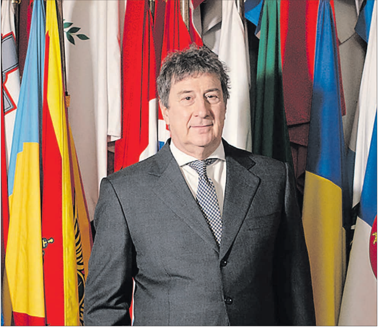
▶▶ The governor of the CEB, Carlo Monticelli.

These lines also serve the purpose of the eight million euros loan with the Council of Europe Development Bank (CEB) for the financing of expenditure in the framework