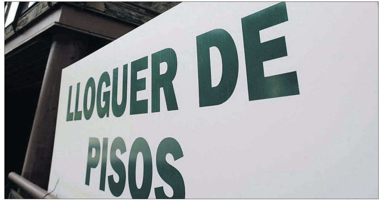
▶▶ A sign announcing the rental of flats in a property.

The advanced CPI for May was announced just last Wednesday. Thus, the estimated year-on-year change is 6.5%, according to the calculation of the leading indicator. If confirmed, it would increase by five tenths of a percentage point compared to the CPI estimated in April (6.0%). This increase in inflation would be due to the rise in prices of two groups: food, due to an acceleration in food prices in general, and transport, as a result of an increase in the