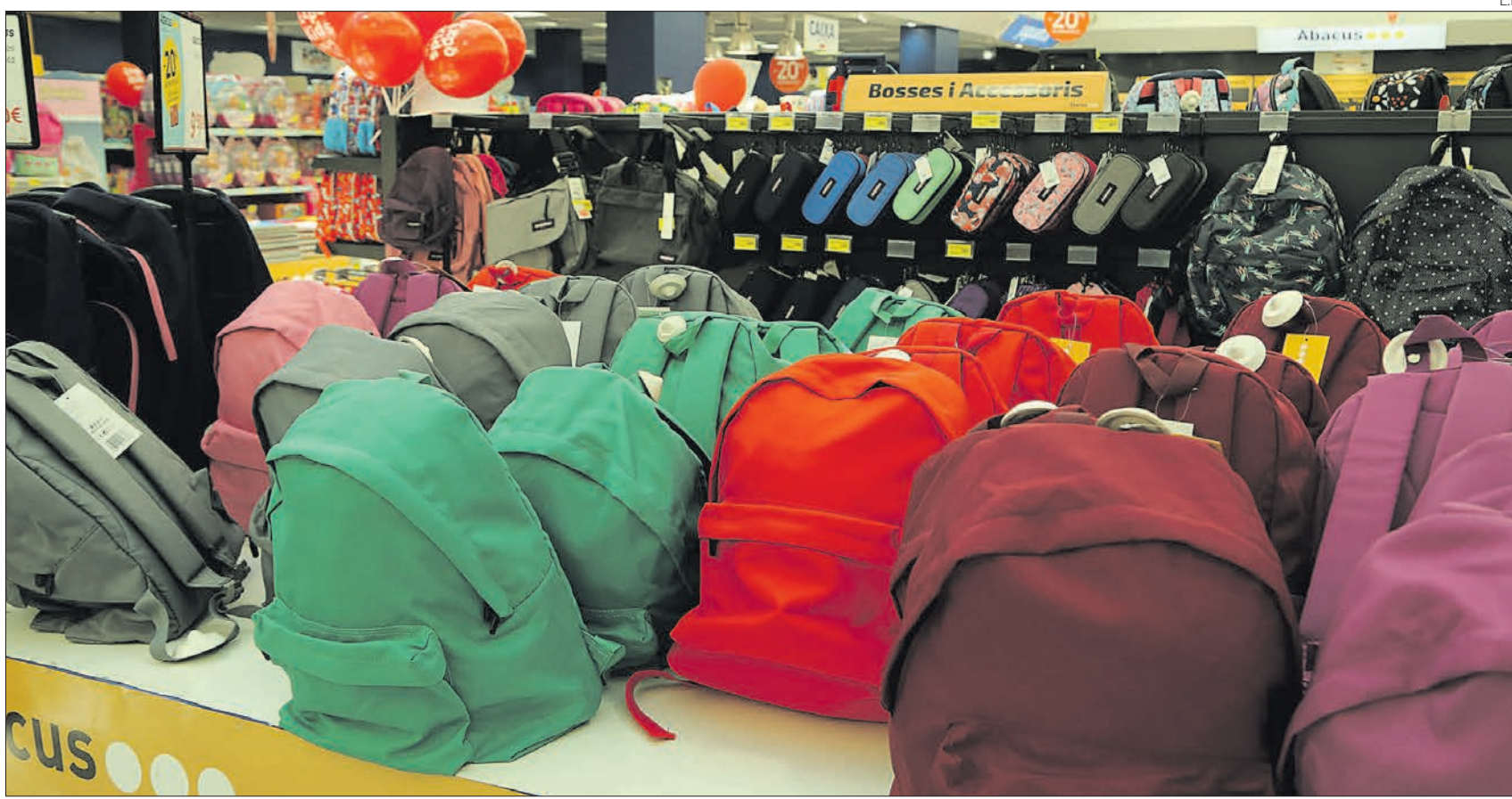
▶► A section of school supplies and backpacks from a bookstore and stationery store in the Principality.

Even so, parents tend to recycle last year's product, a «difficult to manage» alternative for stores, due to the constant modification of the