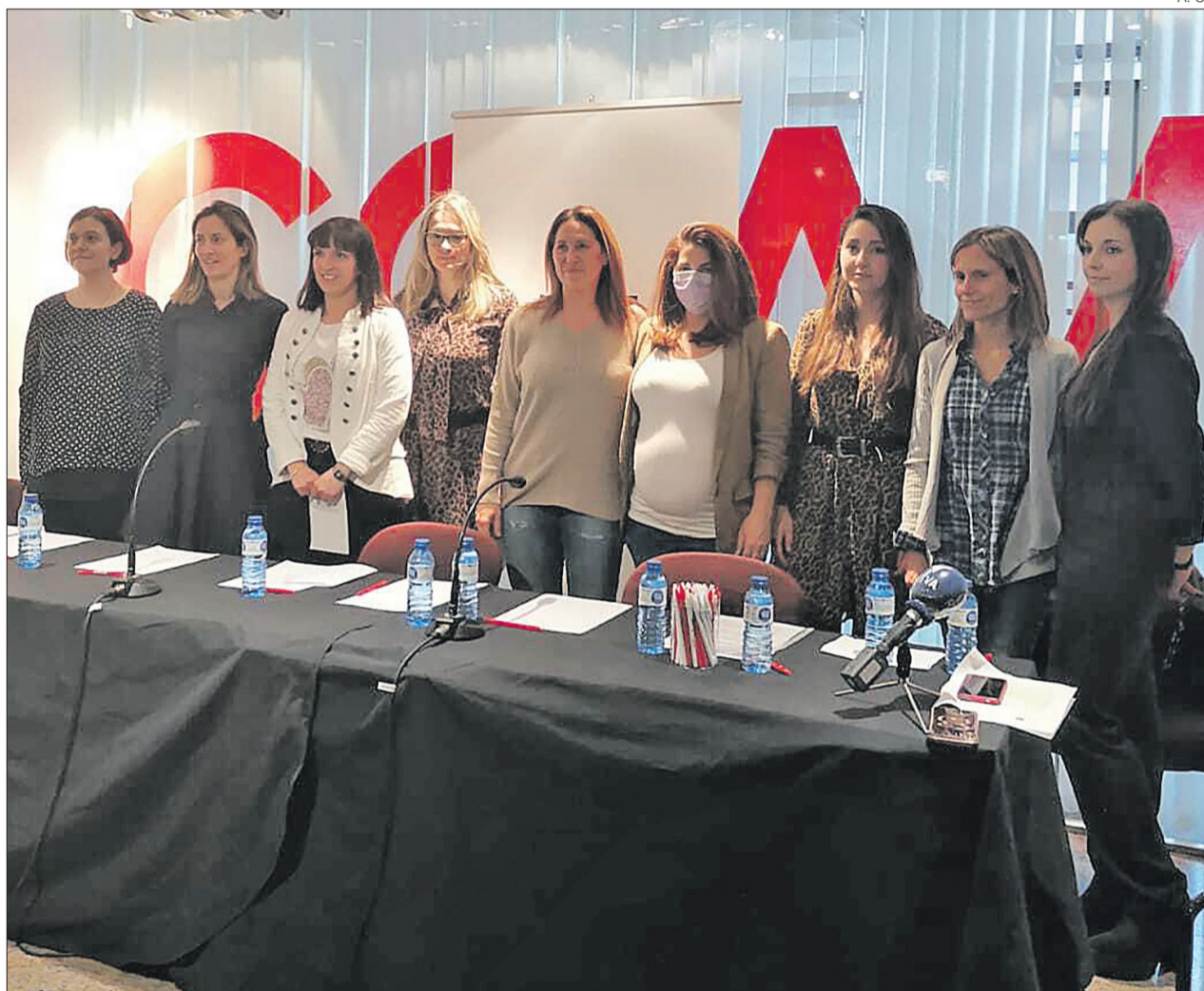
► The joint press conference of the different professional associations in the health field, weeks ago.

As for the final wording of the law, the College of Nurses may study and amend the text, which must be approved before the end of the year in the General Council. «We are interested in not going beyond this legislature, because we have been fighting for 18 years.» So, according to the nurse's president, «I hope our complaints are met, even though we are cautious; We will try to negotiate from all points of view, we are very clear about where we want to go and the door has been opened for us to have a dialogue, and here we have seen the positive side.»