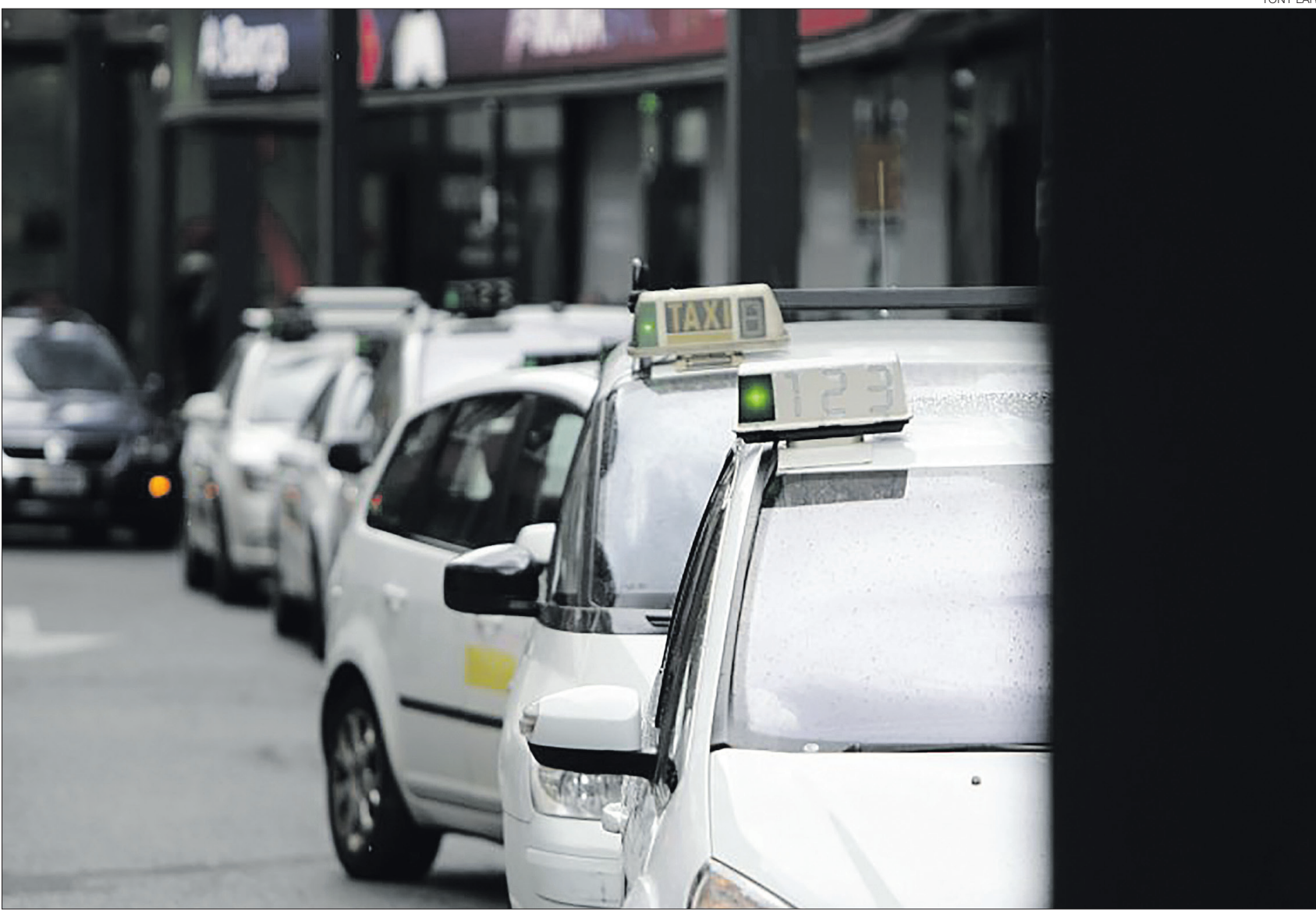
▶► Archive image of a group of taxis waiting at a stop in Andorra la Vella.

UNIFICATION WORK // On the other hand, the president of the Association of Intercity Taxi Drivers (ATI) explained that they are working with the Government on the new regulations for a unified taxi station. «We