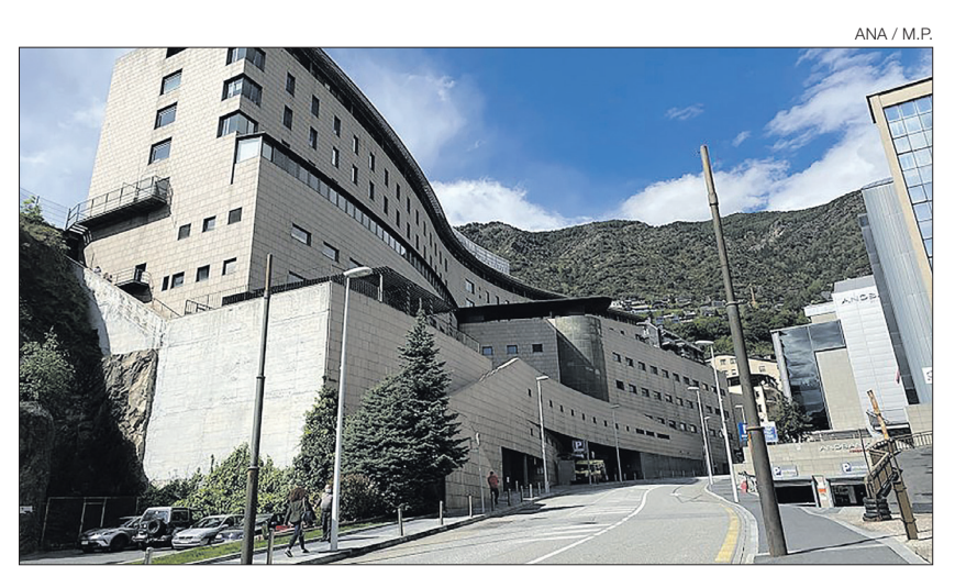
57.9% of the population over the Facade of the Hospital Nostra Senyora de Meritxell.

re are currently six people admitted to the plant and four to the Intensive Care Unit (ICU), where three of them are in a situation of mechanical ventilation. As for the school population, classrooms under active surveillance stand at 49 (-23), either in whole or in part, and 204 (+10) are under passive surveillance. Regarding the vaccination plan, Jover pointed out that the total percentage of people with the complete guideline reaches 82.4%. In this sense, 83.8% of the population over the age of 16 have already received at least one vaccine and