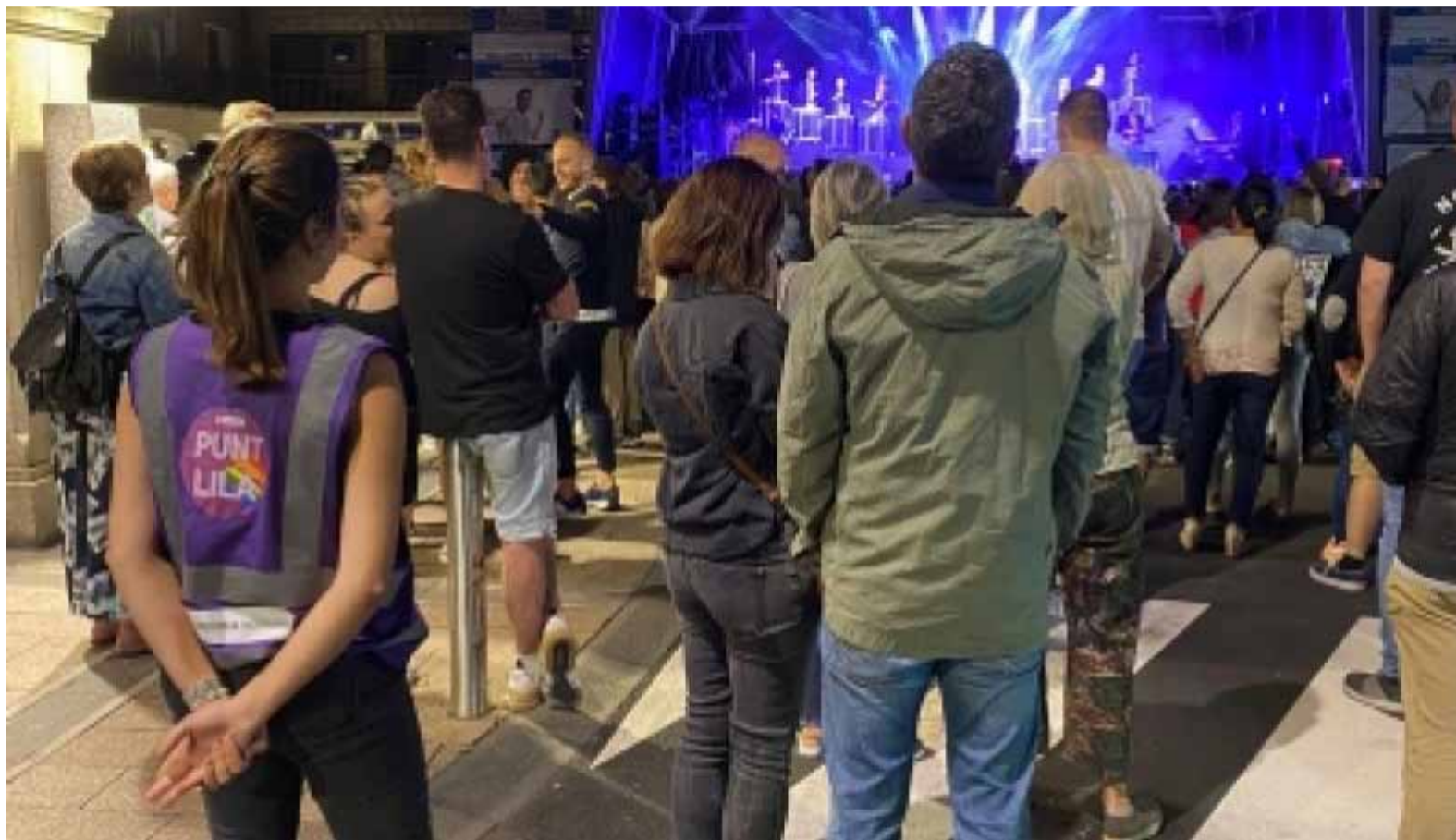
The purple points are established as an essential resource for victims.