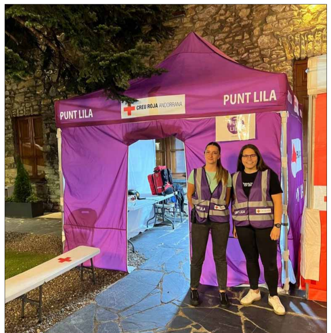
Els punts liles s'erigeixen com un recurs essencial per a les víctimes.

«It is not only a point of attention, it is also an information point and distribution point for glass covers and condoms»