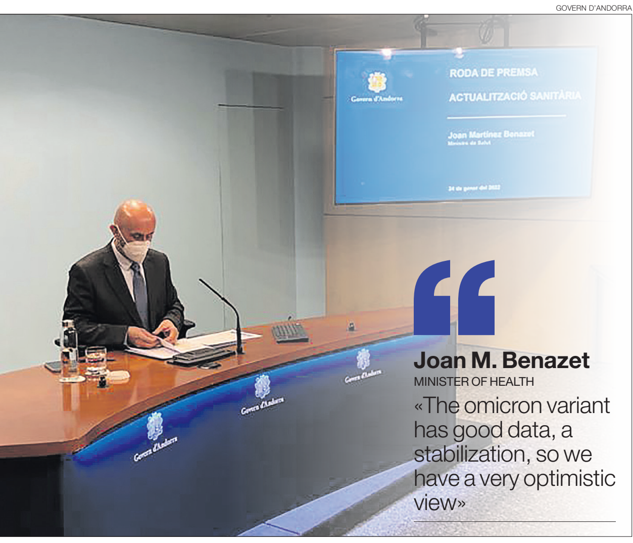
>> The Minister of Health, Joan Martínez Benazet, during the press conference in the administrative building.