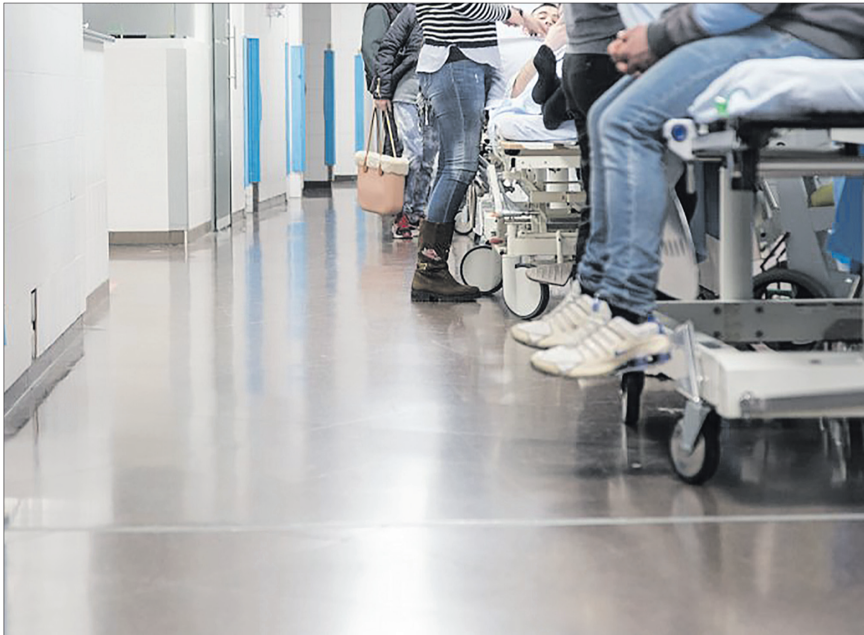
►► File image of patients at Hospital Nostra Senyora de Meritxell.

EL PERIÒDIC ESCALDES-ENGORDANY @PeriodicAND