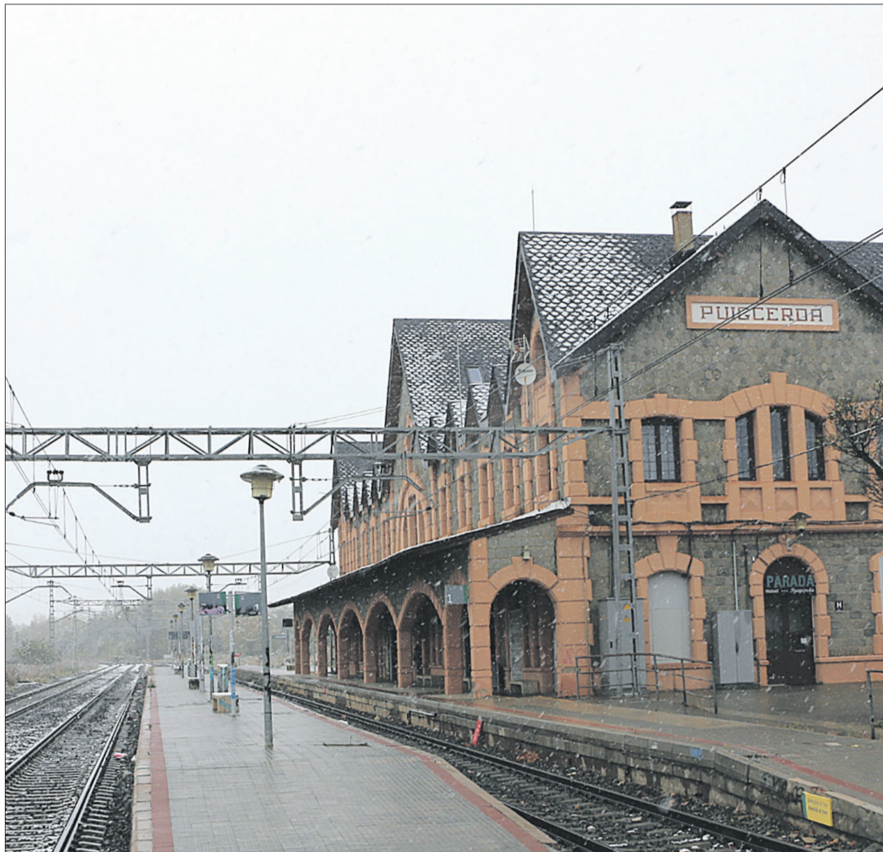
►► Archive image of the Puigcerdà train station.

In the same vein, in relation to the possible rail link from Puigcerdà to Andorra and passing through La Seu d'Urgell, the mayor indicated that this is a «desirable» approach, although it is not so simple, because it is orographically difficult».