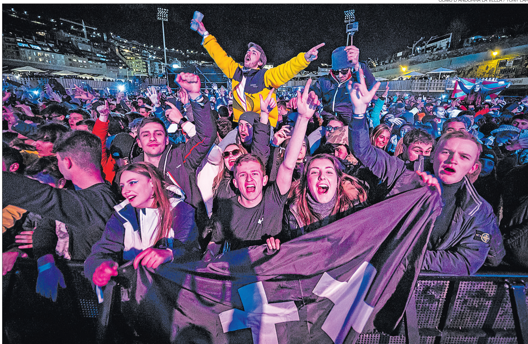
COMÚ D'ANDORRA LA VELLA / TONY LARA

A "MINOR ILLNESS" In relation to health data, 155 new cases were detected over the weekend, bringing the total number of infected to 37,744. Active cases stand at 667 following the declining dynamics of infections in recent weeks and no new deaths were reported, which remain