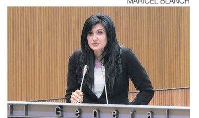
► Archive image of Montaner.