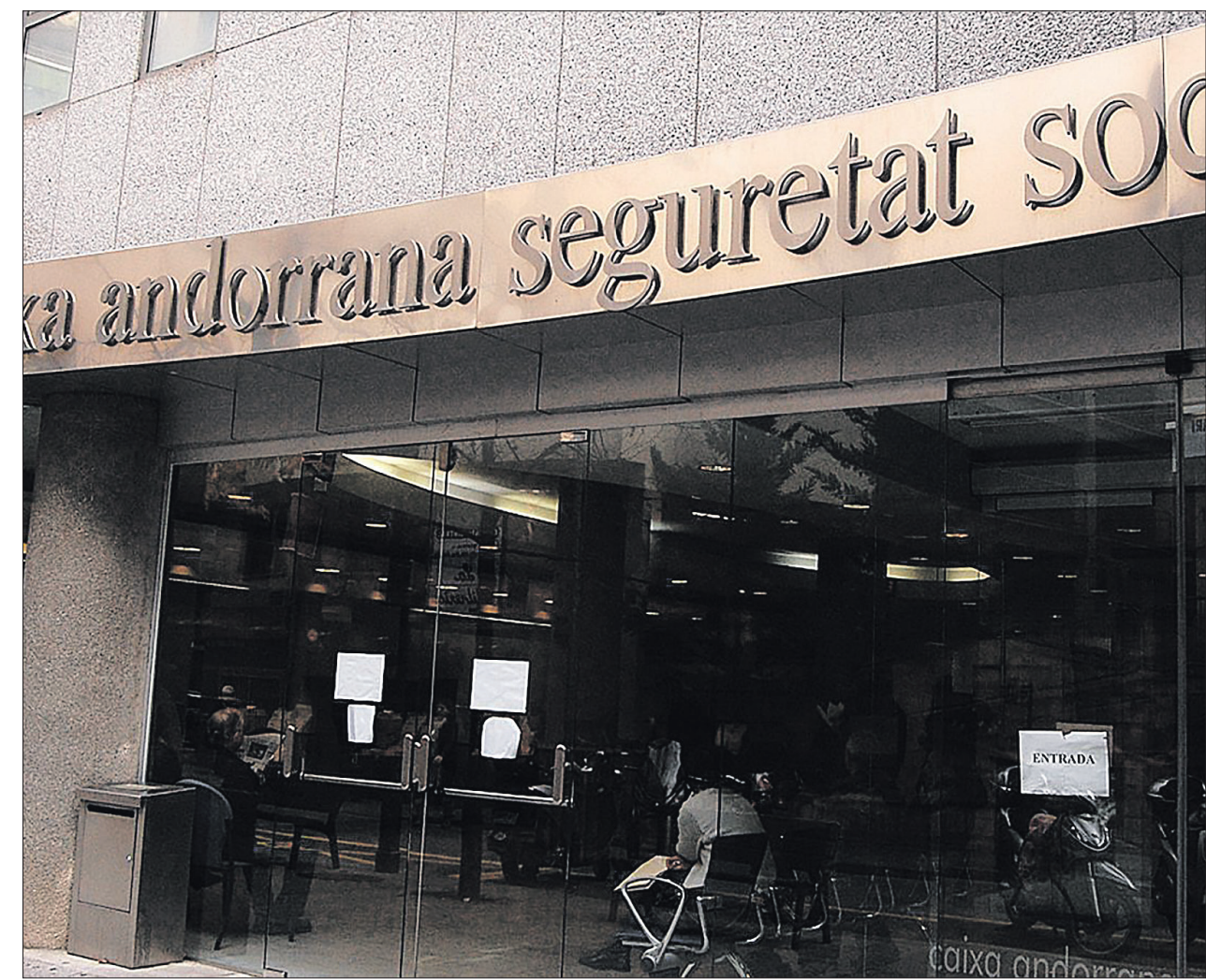
▶► An archive image of the offices of the Andorran Social Security Fund (CASS).

According to the data accumulated over the last 12 months, the average number of employees is 40,126, 9.1% more compared to the same period last year. The sector with the most prominent increase is the hotel industry, with a 41.7% increase. On the other hand, households employing domestic staff fell by 2.6%. In addition, it should be noted that the total wage bill for