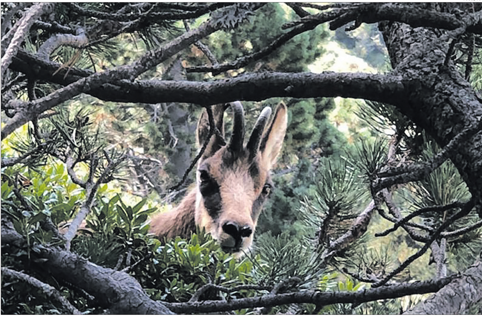
►► File image of a chamois in the forest.

Of this total of 1,300 chamois, however, only 201 may be shot during Chamois Hunting Week-which will be held from September 11th to 18th- and 28 during the Enclar hunting ground. The total number of captures planned for this period takes in-