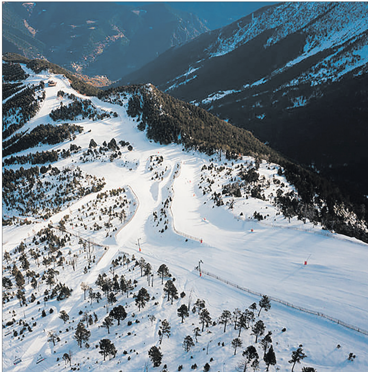
► An archive image of part of the Vallnord-Pal Arinsal ski area.

Following the same direction, Marticella assured that the carbon footprint of the skiers within the domain of the resort is 5% of the total «from the time they leave their home until they return there». In this sense, Setap365 is working on the development of hydrogen for the operation of snow machines. In addition, he also assured that the Principality is one of the pioneers when it comes to optimizing water resources in mountain resorts, especially in winter, through studies with research centers and collaborations with the University of Lleida